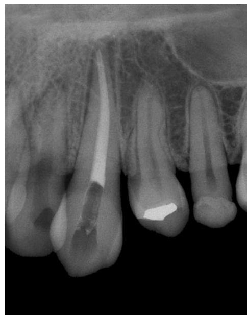
Figure 2. Representative radiographic image of the root canal fillings assessed by the examiners. Note the presence of the simulated void in the apical third.

In the assessment by the endodontist, the experimental groups had statistically lower sensitivity values than the control group only for the coronal third of root canal fillings (Table 2). However, the differences in sensitivity between groups were not statistically significant in any part of fillings when they were evaluated by the radiologist. The coronal part of Endométhasone and Sealer 26 fillings exhibited statistically lower sensitiv-