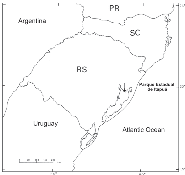
Figure 1. Map of Rio Grande do Sul, showing Parque Estadual de Itapuã, the site of sampling.

This study was carried out in the Parque Estadual de Itapuã (PEI) (30°22'S 51°02'W), located in the city of Viamão, Rio Grande do Sul, Brazil (Fig. 1). PEI is a remnant of the natural landscape of this region, and is destined for conservational