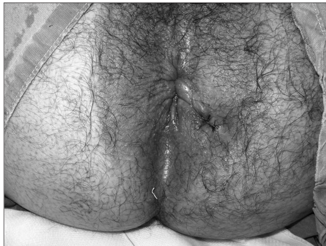
FIGURE 2. Aspect of the perineum after completion of the procedure. The anatomic integrity of the anal canal is entirely preserved

Next, the catheter was slowly withdrawn while the tract was completely filled with glue. The application was concluded with placement of a second large bed of sealant at the external orifice. Finally, the suture at the internal opening was tied completing the procedure. In some cases, a Vicryl suture was also used to close the external orifice (Figure 2). Patients were discharged after few hours. They were instructed not to take sitz baths and to avoid physical activity for at least 2 weeks.