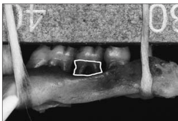
Figure 2 - Area measurements on the buccal aspect.