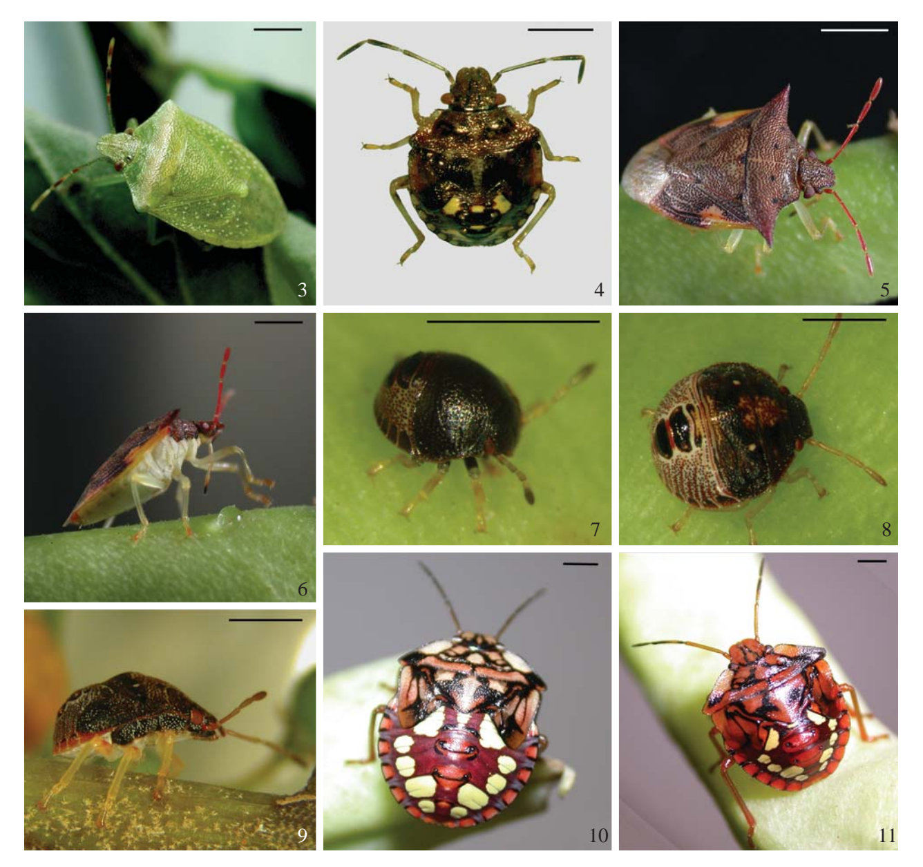
Figs. 3-11. Pentatomoidea of Bagé region. 3 and 4, Thyanta humilis Bergroth: adult (3) and nymph (4); 5-9, Odmalea basalis (Walker): adult (5 and 6), second instar nymph (7), fourth instar nymph (8) and fifth instar nymph (9); 10 and 11, Chinavia aseada (Rolston): fifth instar nymphs, light (10) and dark (11) morphs (scale bar= 2mm).

Brazil, and an accurate description of its species are crucial.