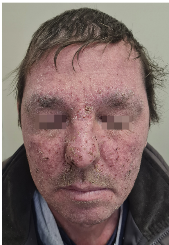
Figure 2 A 49-year-old patient using cetuximab with grade 3 acneiform eruption according to the CTCAE v5.0 grading criteria. Papules and pustules covering >30% of BSA, associated with moderate pruritus and pain, in addition to local superinfection.

self-care; associated with local superinfection with the oral antibiotics used (Fig. 2).