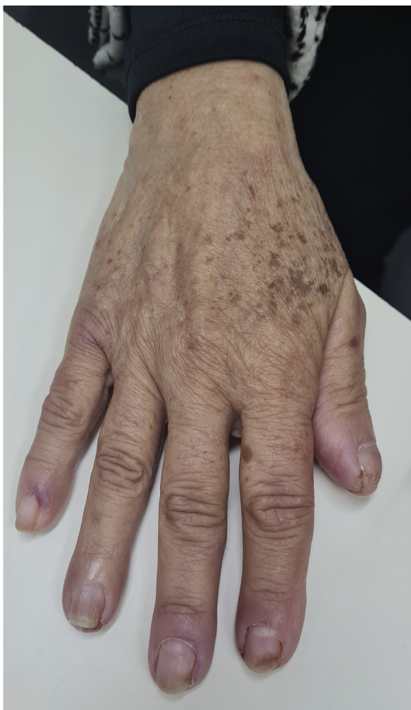
Figure 5 A 69-year-old patient using cetuximab with periungual changes which appeared two weeks after starting the medication.

of paronychia. Its high frequency in patients using these medications can be explained by repeated trauma and/or inflammation of the periungual tissues and the high vascularity of the nail unit (Fig. 6). Studies have suggested that there is a large number of vascular endothelial growth factor (VEGF) receptors at this location, which would allow more of these reactions to occur at these sites 49 . Paronychia and periungual granulomas are mostly reported in response to EGFRi, with an incidence close to 17%, including all grades of toxicity 5,48,49 .