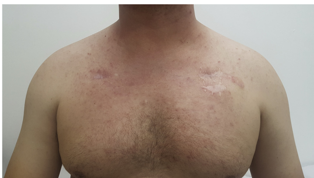
Figure 1 A 36-year-old patient using cetuximab with grade 1 acneiform reaction in CTCAE v5.0 grading criteria. Papules and pustules on the upper trunk, covering less than 10% of the body surface.