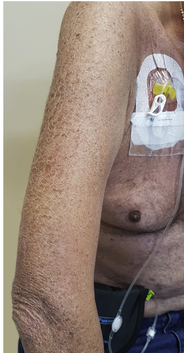
Figure 4 A 63-year-old patient using cetuximab for the treatment of colorectal carcinoma with severe xerosis.

The physiopathological mechanism that leads to the development of these periungual lesions remains unknown. It is believed that the lesions result from the inhibition of EGFR and regulatory pathways of suprabasal keratinocyte proliferation, which would lead to changes in epidermal cell differentiation and migration associated with the inhibition of keratinocyte proliferation and decreased cell survival through apoptosis induction. As a result, the periungual epidermis becomes thinner and may be more susceptible to trauma, thus causing a similar reaction to inflammation secondary to the presence of a foreign body. The possibility of the participation of intracellular retinoid metabolism is also