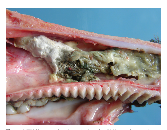
Figure 1. Wild boar nasal cavity sagittal section. Yellow and green plaquelike masses of fungal growth in the mucosal surface.

The lungs tested showed positivity for Pneumocystis in PCR, Grocott staining and IHC (Figure 2). Mycological examination from plaques fragments from the nasal cavity surface detected Aspergillus fumigatus , A. flavus and Candida albicans .