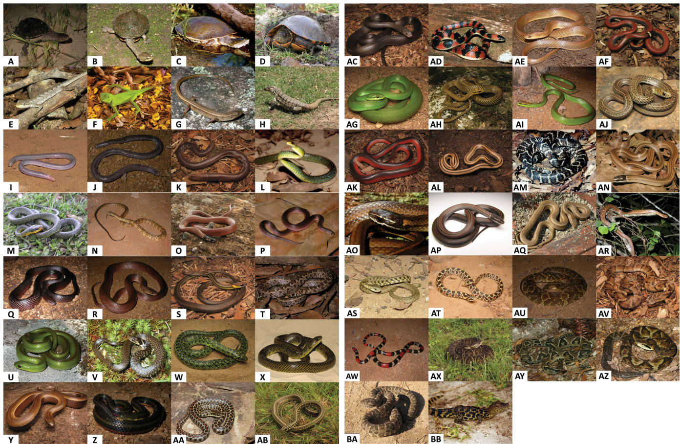
Figure 2. Reptile of Sinos River Basin: A. Acanthochelys spixii , B. Hydromedusa tectifera , C. Phrynops hilarii , D. Trachemys dorbigni , E. Anisolepis grilli , F. Enyalius iheringii , G. Cercosaura schreibersii , H. Salvator merianae , I. Amphisbaena kingii , J. Amphisbaena prunicolor , K. Amphisbaena trachura , L. Chironius bicarinatus , M. Chironius exoletus , N. Mastigodryas bifossatus , O. Tantilla melanocephala , P. Attractus reticulatus , Q. Boiruna maculata , R. Clelia hussami , S. Echivanthera cyanopleura , T. Erythrolamprus almadensis , U. Erythrolamprus jaegeri , V. Erythrolamprus miliaris , W. Erythrolamprus poecilogyrus , X. Erythrolamprus semiaureus , Y. Gomesophis brasiliensis , Z. Helicops infrataeniatus , AA. Lygophis anomalus , AB. Lygophis flavifrenatus , AC. Oxyrhopus rhombifer , AD. Oxyrhopus clathratus , AE. Paraphimophis rustica , AF. Phalotris lemniscatus , AG. Philodryas aestiva , AH. Philodryas arnaldoi , AI. Philodryas olfersii , AJ. Philodryas patagoniensis , AK. Pseudoboa haasi , AL. Psomophis obtusus , AM. Sibynomorphus neuwiedi , AN. Taeniophallus affinis , AO. Taeniophallus bilineatus , AP. Taeniophallus poecilopogon , AQ. Thamnodynastes hypoconia , AR. Thamnodynastes strigatus , AS. Tomodon dorsatus , AT. Xenodon dorbignyi , AU. Xenodon merremii , AV. Xenodon neuwiedi , AW. Micrurus altirostris , AX. Bothrops alternatus , AY. Bothrops cotiara , AZ. Bothrops jararaca , BA. Bothrops pubescens , BB. Caiman latirostris .