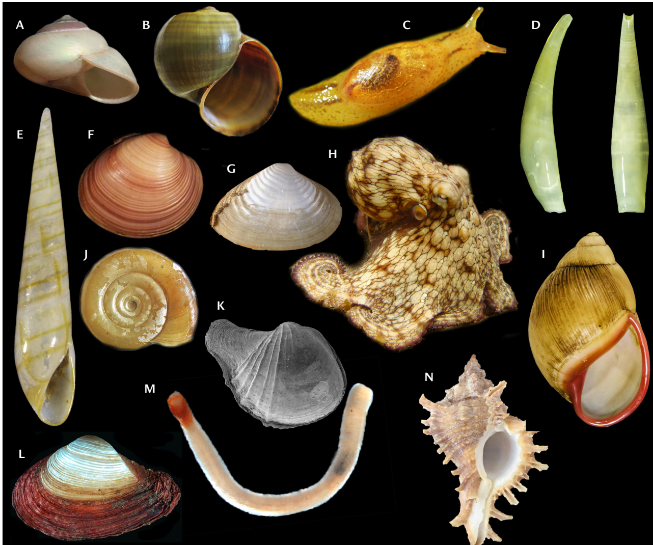
Figure 1. A small fraction of the diversity of shapes and colours of the Brazilian malacofauna: (A) Gaza compta Simone & Cunha, 2006, 19 mm long, marine gastropod, Margaritidae; (B) Pomacea maculata Perry, 1810, ~45 mm long, freshwater gastropod, Ampullariidae; (C) Omalonyx convexus (Heynemann, 1868), 2 cm long, terrestrial gastropod, Succineidae; (D) Gadila pandionis (Verrill & Smith, 1880), 11 mm long, scaphopod, Gadilidae; (E) Eulima bifasciata d'Orbigny, 1841, 8.1 mm long – marine gastropod, Eulimidae; (F) Eucallista purpurata (Lamarck, 1818), ~45 mm long, marine bivalve, Veneridae; (G) Mactrella janeiroensis (E.A. Smith, 1915), 27.7 mm long, marine bivalve, Mactridae; (H) Octopus insularis Leite & Haimovici, 2008, ~80 mm long – cephalopod, Octopodidae; (I) Megalobulimus oblongus (Müller, 1774), ~118 mm long, terrestrial gastropod, Strophocheilidae; (J) Biomphalaria glabrata (Say, 1818), ~15 mm long, freshwater gastropod, Planorbidae; (K) Cardiomya minerva Lima, Oliveira & Absalão, 2020, 4.3 mm long, SEM image, marine bivalve, Cuspidariidae; (L) Corbula patagonica d'Orbigny, 1846, ~14 mm long, marine bivalve, Corbulidae; (M) Scutopus variabilis Passos, Corrêa & Miranda, 2021, ~12 mm long, aplacophoran, Caudofoveata; (N) Chicoreus brevifrons (Lamarck, 1822), ~40 mm long, marine gastropod, Muricidae.

microplastic pollution (Schaeffer-Novelli 1990, Migotto et al. 1993 Wang et al. 2021), trawling (Rogers et al. 2022), shell collecting (Zhang and Wu 2020, although that activity can