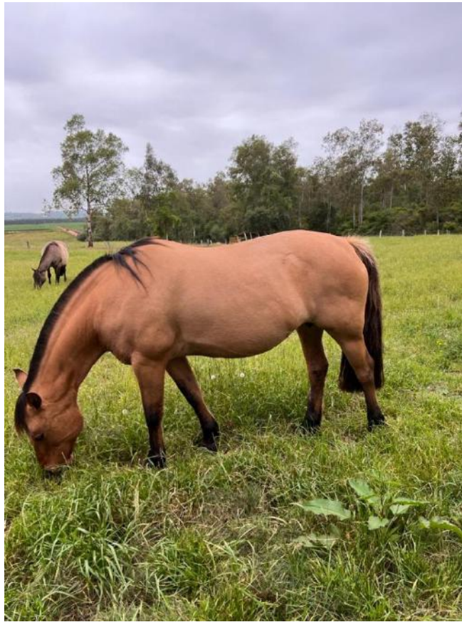
Figure 3 - The owner reported that the patient no longer experiences abdominal discomfort and shows stability in the case.