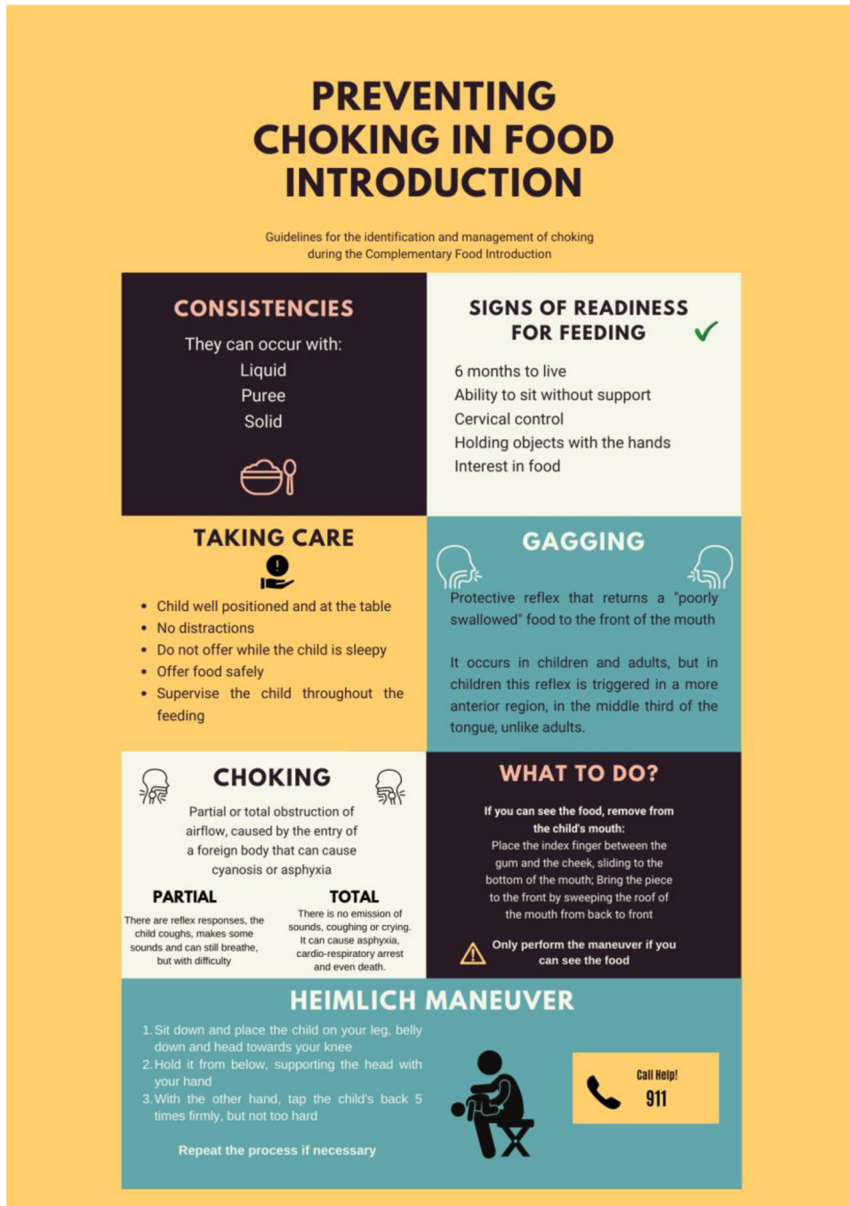
Figure 1 Folder – Gagging or Choking guidelines provided to parents during the intervention at 5.5 months of age.

Mother and child data were collected using an online questionnaire, the questioned data were: maternal schooling level (years), maternal skin color (White or non-White—Mixed-race, Black, and Yellow), marital status (living with a partner or not), number of children, monthly family income (Brazilian reais), prenatal care (yes or no), breastfeeding guidance (yes or no), type of childbirth (cesarean section or