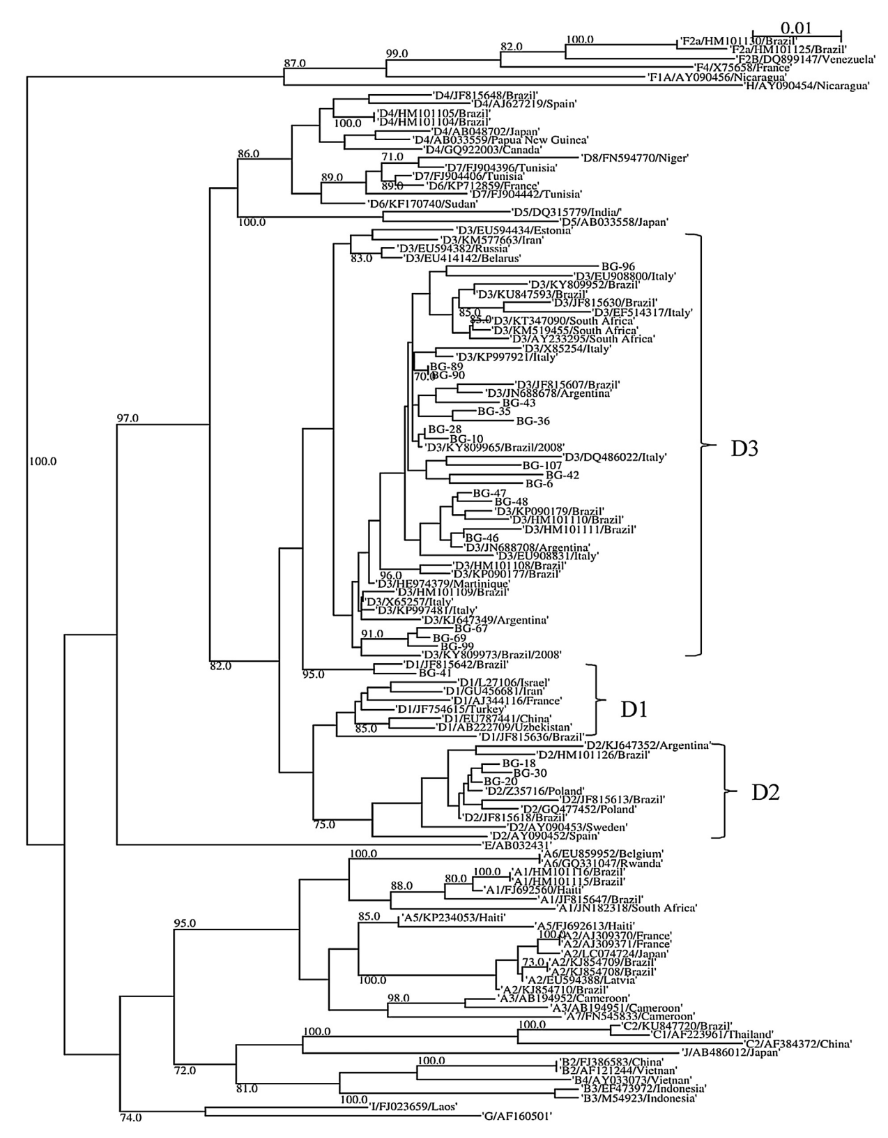
Fig. 2 – Phylogenetic tree of S/P gene fragment (590 bp) of 21 patients with active hepatitis B infection in Bento Gonçalves city, Rio Grande do Sul State, 2010. The sequences evaluated in this study are represented by the acronym BG (Bento Gonçalves) followed by the identification number of the sample. Sequences obtained on GenBank are demonstrated by the subgenotype information followed by the sequence accession number. The numbers at each node correspond to bootstrap values (greater than 60%) obtained with 1000 replicates. The scale bar indicates the genetic distances.