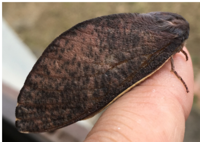
Figure 1. Adult female Almeidella corrupta from Paraíso do Sul, Rio Grande do Sul, Brazil, progenitor of the offspring reared in the present article.