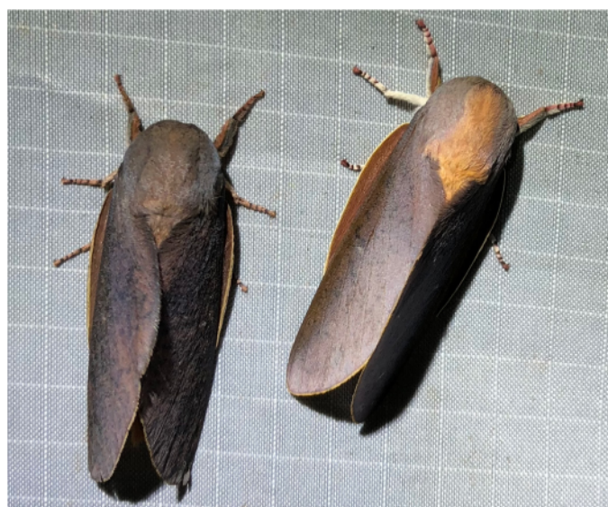
Figure 2. Adult males of sympatric Almeidella at Paraíso do Sul, Rio Grande do Sul, Brazil. Left: A. corrupta , right: A. approximans .

Walz in Pedro Leopoldo, Minas Gerais, Brazil (Fig. 3) that we identified as A. corrupta based on our rearing efforts in Rio Grande do Sul, but we appreciate the fact that this may represent another Almeidella species (such as A. approximans , which also occurs in Minas Gerais).