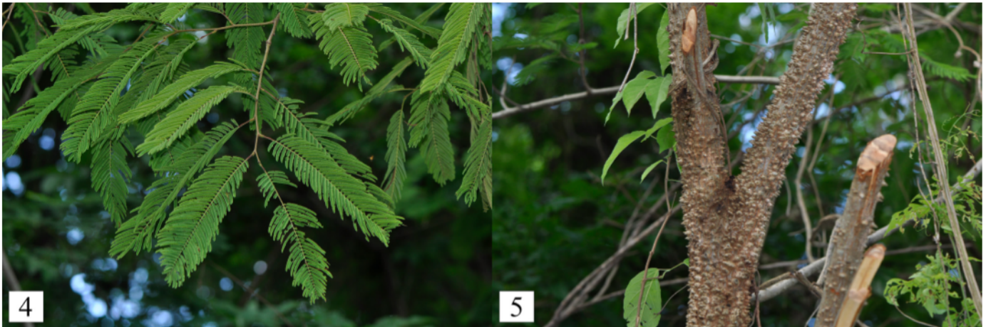
Figures 4, 5. Natural host plant of Almeidella, Anadenanthera peregrina (Fabaceae), in Pedro Leopoldo, Minas Gerais Brazil. 4. Leaves. 5. Bark.