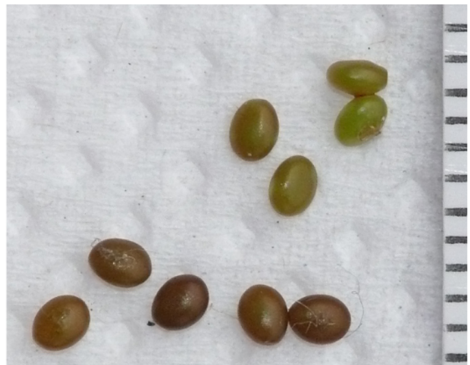
Figure 6. Eggs of Almeidella corrupta showing two distinct color forms, brown and green. Scale bars are each 1 mm.

Eggs are ovoid in shape and slightly flattened. Two distinct color forms of the eggs were observed: dark brownish green and lighter green. The color differences were not a result of differential development since both colors were observed at the same times immediately after oviposition. The chorion is somewhat opaque such that larval development, while visible,