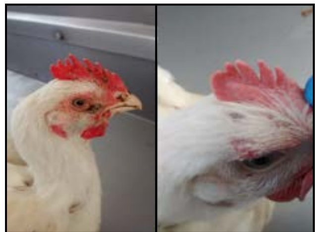
Figure 1. Macroscopic lesions of a cutaneous myxoma in a 42-day-old broiler. Numerous nodular proliferative lesions on the comb, periocular skin region, and on the nostrils of the bird.

Microscopically, the lesions consisted of irregular multifocal proliferation of connective tissue showing spindle cells with poorly demarcated borders and scarce cytoplasm in a slightly basophilic myxoid aspect matrix (Figure 2). The adjacent epidermis was compressed by neoplastic proliferation. No areas of epithelial hyperplasia or inclusion bodies were observed. The scabs were characterized by amorphous eosinophilic material containing inflammatory cells (heterophils and lymphocytes), bacterial basophilic