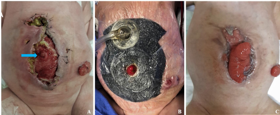
Fig. 2. A: Early post-operative eventration and enteroatmospheric fistula (blue arrow). B: Negative pressure wound therapy dressing excluding fistula and ileostomy. C: NPWT result with wound epithelialization and maintained and prolapsed fistula.