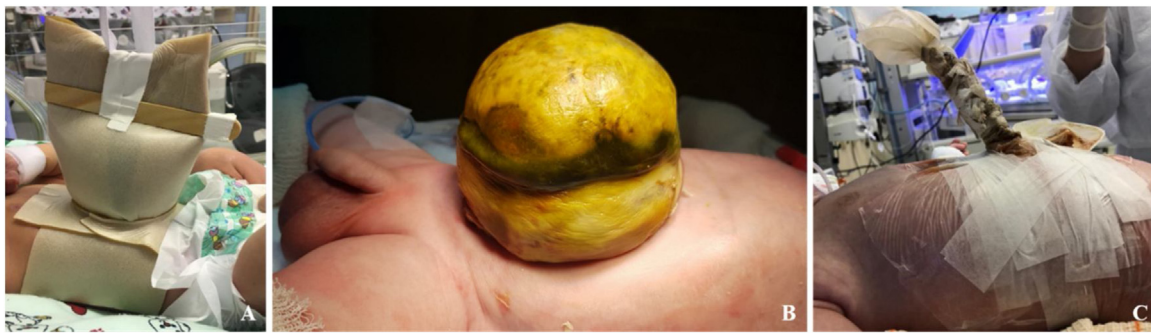
Fig. 1. A: Hydrocolloid dressing. B: Omphalocele with bowel perforation and meconial content within the sac. C: Complete content reduction into the abdominal cavity.