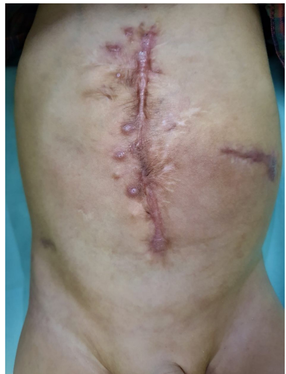
Fig. 5. Ninth month post-operative follow up result.

The patient’s family was extremely satisfied and thankful with the results and all the care provided by the team. During hospi-