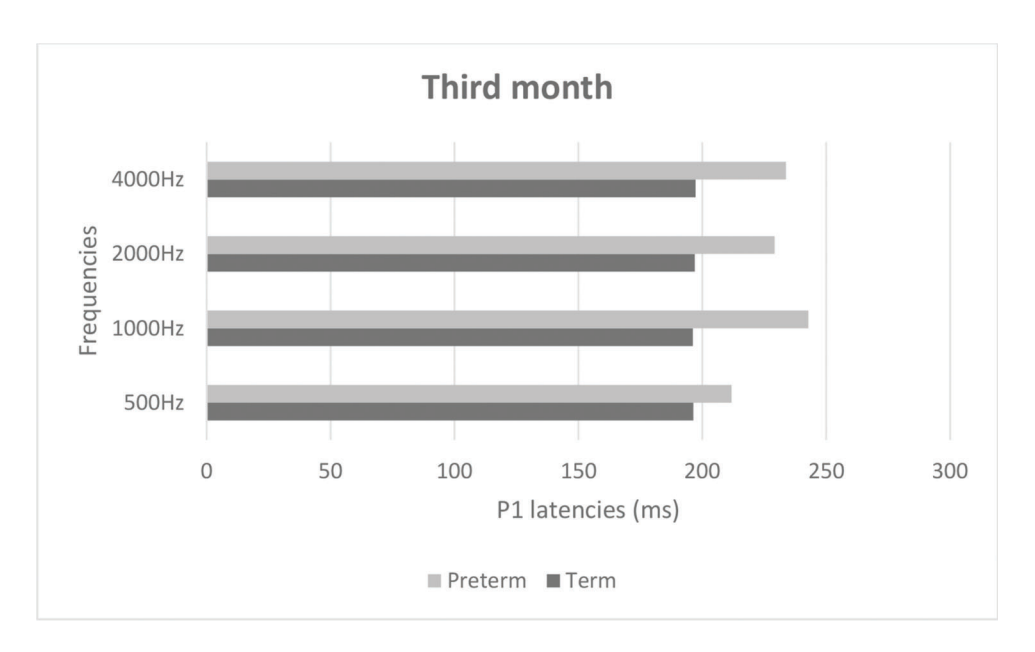
Figure 3 - P1 latency values in term and preterm infants in the third month of life.

described greater differences in latencies of potential during the third month of life, suggesting central auditory system immaturity in the preterm group, despite the corrected age.