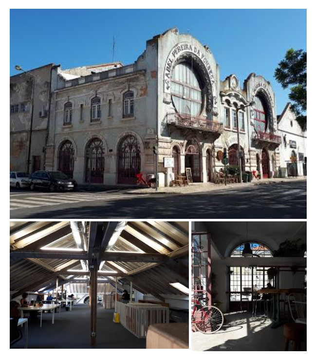
Figure 2: Views of the internal streets. HCB. Lisbon.

Exploring nostalgic atmosphere aestheticizing decadence, these interventions involve a slow erasure of existing-memory and an invention of consumable memories, which transforms the cultvalue of its heritage into an exhibition-value. Then, theatricalized, themed and touristic amusement parks appear. This touristic feature, by being disguised, weakens social and community networks that are unable to oppose ongoing projects, leading to the gradual process of gentrification<sup>5</sup> (LIPOVETSKI; SERROY, 2015; KENDZIOR, 2014; MANTANER; MUXI, 2014). The 22@ project, in Barcelona, can illustrate the phenomenon, where the industrial memory of Poblenou was erased, under the discourse of recreating a "sustainable" industrial zone, linked to