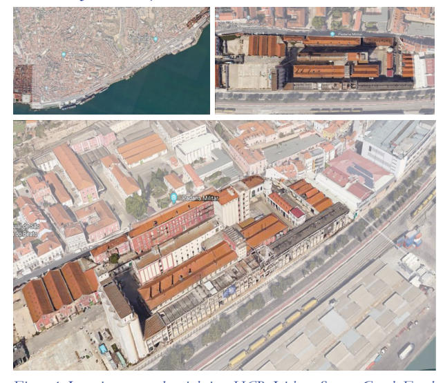
Figure 1: Location, top and aerial view. HCB. Lisbon.

With the liberal revolution (1820) and the extinction of the religious orders in Portugal (1834), the riverside part of this territory was "rehabilitated" with the occupation of the ruins by industrial activities that benefited from the proximity to the river, the port and the railroad (1856). In this context, the former Convento da Grilas was occupied by the MM Factory, in 1897 (JFB, n.d.)