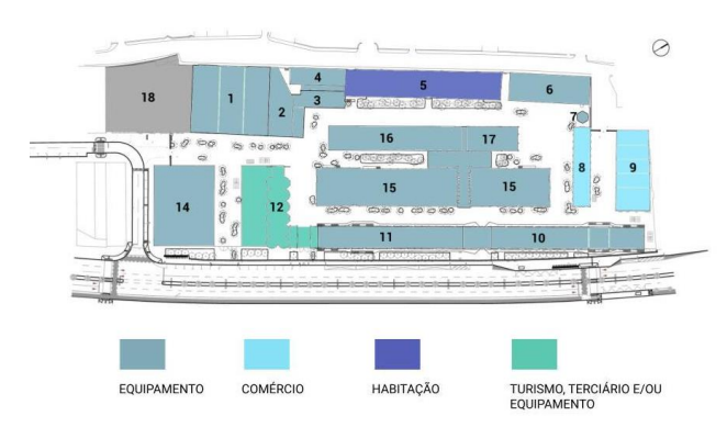
Figure 4: Proposed uses. HCB. Lisbon.

Considering the discourse, scale and audience of the HBC, it must be understood as part of a global urban competitiveness strategy, and its possible social