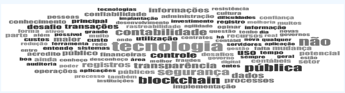
Figure 1. Word cloud.

In the content analysis of the three open questions, the data were tabulated and organized into categories (Bardin, 1977), according to the frequency of words (Figure 1). The seven categories of analysis are technology, government accounting, security, transparency, control, change, and knowledge. The analysis of each category is presented below, transcribing some responses identified with R (respondent) and a number indicating a chronological order of respondents established during the analysis.