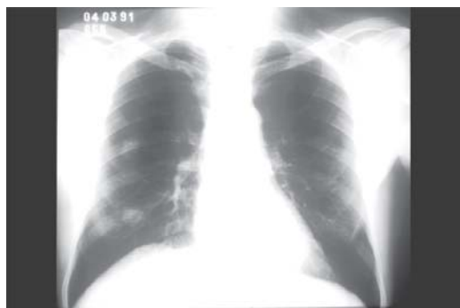
Fig. 4 - Chest X-Ray of patient 16 showing pulmonary nodules.

CNS nocardiosis: Patient number 17 was a 60 year-old alcoholic man who underwent radiotherapy to a larynx cancer seven years ago; he was on chemotherapy due to a non-Hodgkin lymphoma of small bowel when he was admitted with fever, headache and drowsiness. No lung abnormality was noticed either at Chest X-Ray or at