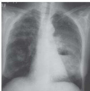
Fig. 2 - Chest X-Ray of patient 2 showing multiple pulmonary nodules in both lungs, being one at right excavated with thick walls; also we can see consolidations in the SRL; the biggest nodule is excavated (at left lung), with retained secretions and liquid level.