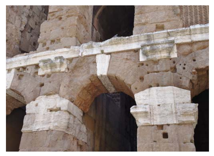
Figure 3: Constructive detail of fittings of different stones.