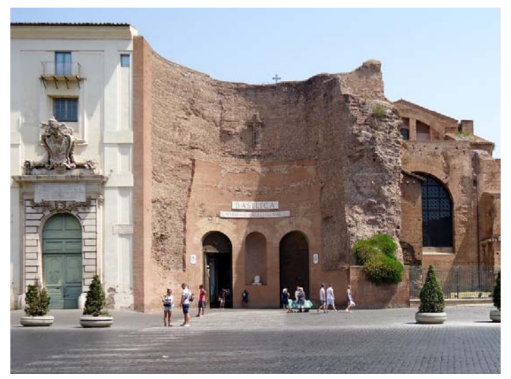
Figure 8: Detail of the entrance, reusing the doors inserted in the stretch of the semicircular wall that remained from the caldarium.