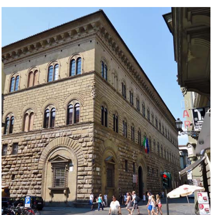
Figure 1: The inginocchiati windows inserted in the base of Palazzo Medici.

opposite gate were closed, which used to access rooms for the administration of the Medici Bank (Figure 1). With a plan of square proportion (smaller than the current room) without connection with the palace, the loggia pubblica had in each facade of the corner a span framed by the radiating-voussoir arches. An unusual solution in the local civil architecture, it did not have repercussions on the later production, having as a precedent - apparently unique - the Loggia del Bigallo, in Piazza del Duomo. It is said that it was intended for contrattazione (business), but also to meeting of citizens, having even been guarded, on the return of the Medici from exile, in 1512: a much smaller civilian version of the Loggia dei Lanzi, also called Loggia della Signoria, linked to Palazzo Vecchio. It is also necessary to consider the stage function of public ceremonies of the family, like the Loggia Rucellai, when it was not an occasion for the semi-public environment of the arcades of the patio. Lorenzo, the Duke of Urbino, who resided in the palace at the time, decided to the closing of the loggia under the argument of the loss of its initial functions.