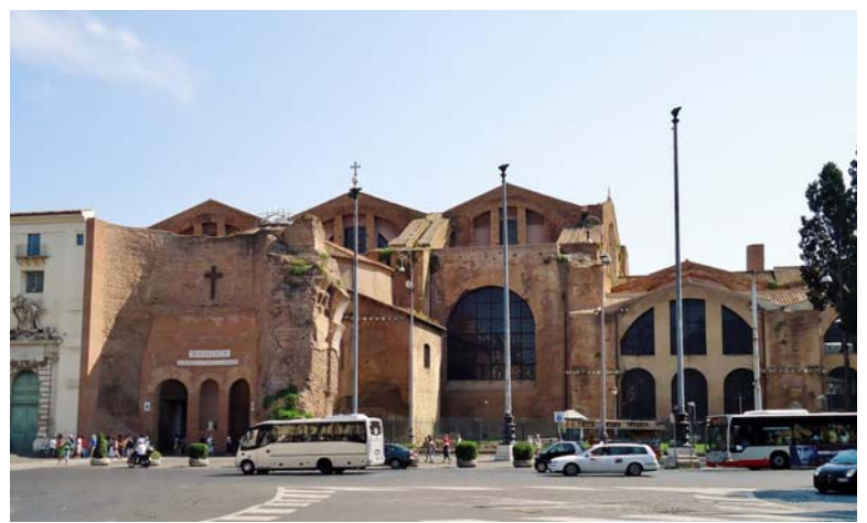
Figure 5: Facade of the Basilica de Santa Maria degli Angeli, facing the Republic Square.