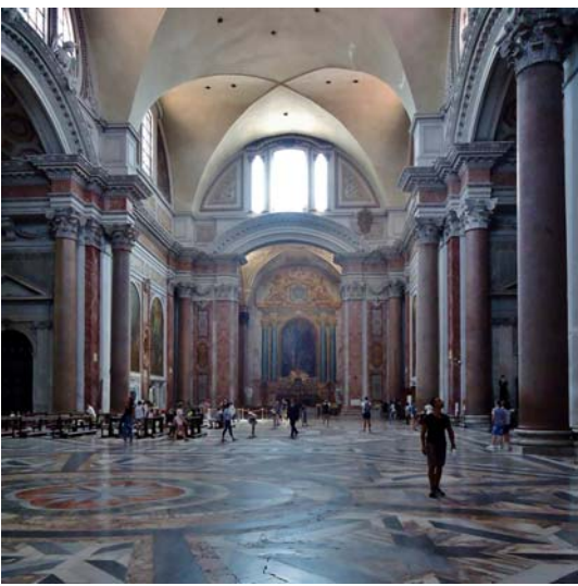
Figure 9: View of the great transept, with polychromy of Vanvitelli intervention.

Argan even postulated that Michelangelo" did not just protect those things he admired as an artist, he also stated his aversion to the programs of renovatio, to the classicist interpretation of the antique, and to the reduction of the antique to precepts for modern construction". If his anticlassical architecture was the answer to the last two aspects, his aversion to the renovatio was demonstrated on occasions such as when he opposed the transfer of the statue of Marcus Aurelius to the Campidoglio Square, thus defined by Paul III. In the reuse of the Thermae, he practically gave up intervening, adding and removing a minimum of matter. For Bruno Zevi this was "the supreme text of the not-finished and the highest point of this transcendentalism" (1964 apud ARGAN, 2012, p. 309). The incompleteness of the great structure brought about by the weariness of nature and man (plunder of marble and building materials) is susceptible of interpretation as non-finito . The fascination with the unfinished form, pursued since the first slaves carved, reflected in his art the existential drama of the transience of sensible reality; and we are tempted to extend it to architecture. A legacy of the philosophical initiation received in the Neoplatonic Academy of Florence, inaugurated by Marsilio Ficino, in 1462, under the patronage of the Medici.