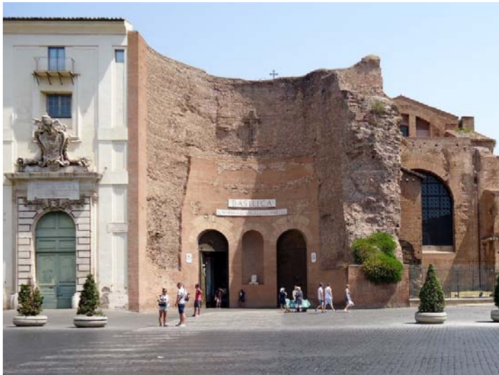
Figure 8: Detail of the entrance, reusing the doors inserted in the stretch of the semicircular wall that remained from the caldarium.