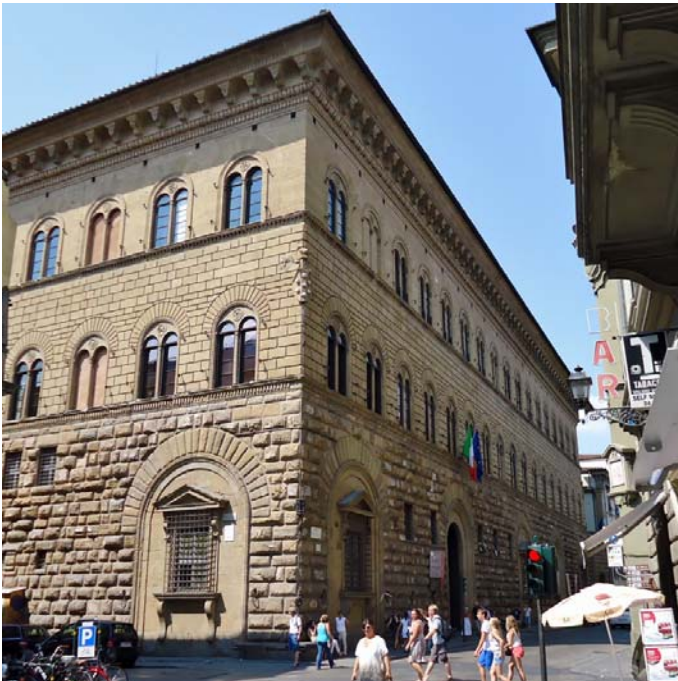
Figure 1: The inginocchiati windows inserted in the base of Palazzo Medici.

opposite gate were closed, which used to access rooms for the administration of the Medici Bank (Figure 1). With a plan of square proportion (smaller than the current room) without connection with the palace, the loggia pubblica had in each facade of the corner a span framed by the radiating- voussoir arches. An unusual solution in the local civil architecture, it did not have repercussions on the later production, having as a precedent - apparently unique - the Loggia del Bigallo, in Piazza del Duomo. It is said that it was intended for contrattazione (business), but also to meeting of citizens, having even been guarded, on the return of the Medici from exile, in 1512: a much smaller civilian version of the Loggia dei Lanzi, also called Loggia della Signoria, linked to Palazzo Vecchio. It is also necessary to consider the stage function of public ceremonies of the family, like the Loggia Rucellai, when it was not an occasion for the semi-public environment of the arcades of the patio. Lorenzo, the Duke of Urbino, who resided in the palace at the time, decided to the closing of the loggia under the argument of the loss of its initial functions.