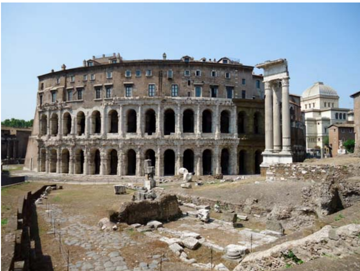
Figure 2: The ruins of Teatro di Marcello with the Palazzo Orsini above.

Between 1962 and 1965, the palace received an intervention of modern lineage, composing another layer of the complex case. This was the work of Ludovico Quaroni, an architect for whom ancient architecture was a very expensive theme for his poetics (GRECO/REMIDDI, 2003, p. 14). Quaroni made functional adaptations in parallel to the necessary works of static restoration, with the collaboration of Gabriella Esposito and Luciano Giovanini.