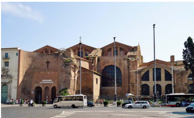
Figure 5: Facade of the Basilica de Santa Maria degli Angeli, facing the Republic Square.