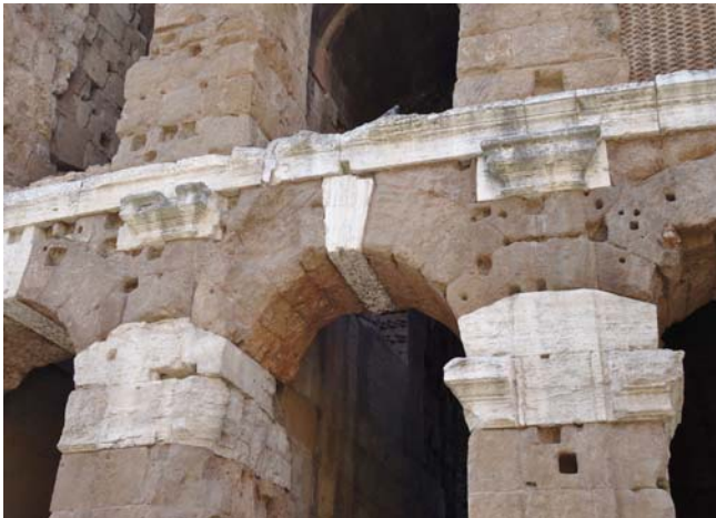
Figure 3: Constructive detail of fittings of different stones.