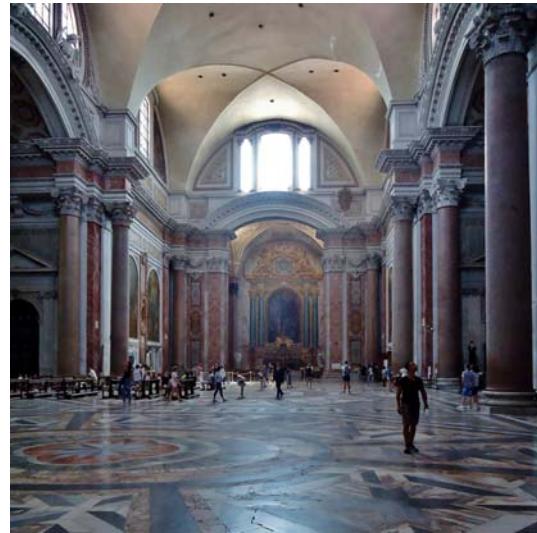
Figure 9: View of the great transept, with polychromy of Vanvitelli intervention.

Argan even postulated that Michelangelo “did not just protect those things he admired as an artist, he also stated his aversion to the programs of renovatio , to the classicist interpretation of the antique, and to the reduction of the antique to precepts for modern construction”. If his anticlassical architecture was the answer to the last two aspects, his aversion to the renovatio was demonstrated on occasions such as when he opposed the transfer of the statue of Marcus Aurelius to the Campidoglio Square, thus defined by Paul III. In the reuse of the Thermae , he practically gave up intervening, adding and removing a minimum of matter. For Bruno Zevi this was “the supreme text of the not-finished and the highest point of this transcendentalism” (1964 apud ARGAN, 2012, p. 309). The incompleteness of the great structure brought about by the weariness of nature and man (plunder of marble and building materials) is susceptible of interpretation as non-finito . The fascination with the unfinished form, pursued since the first slaves carved, reflected in his art the existential drama of the transience of sensible reality; and we are tempted to extend it to architecture. A legacy of the philosophical initiation received in the Neoplatonic Academy of Florence, inaugurated by Marsilio Ficino, in 1462, under the patronage of the Medici.