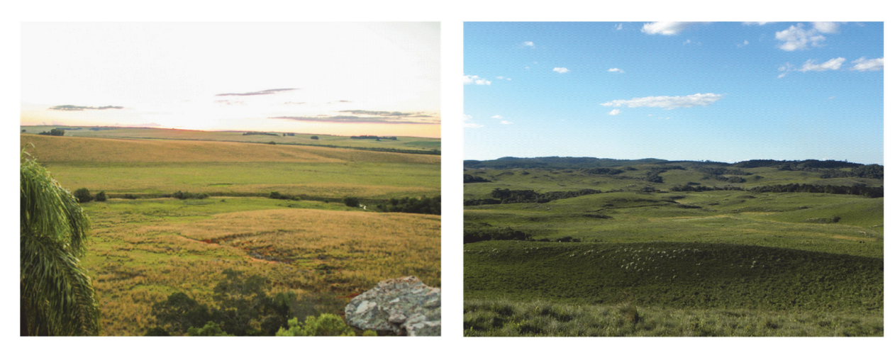
Figure 2. Examples of grasslands from southern Brazil. Grasslands landscape in Alegrete, Rio Grande do Sul state (Pampa Biome, left); grasslands landscape in Palmas, Paraná state (Atlantic Forest Biome, right).

We recorded 4753 individuals of 187 species in point counts, and 4436 individuals of 173 species in transects. There were 158 species shared between the two methods, 29 species were recorded only in point counts, and 15 only in transects (Table 1). The two methods did not differ in abundance of birds recorded (Wilcoxon signed rank test: V = 4623; P =0.31), but they resulted in a significant difference in richness (Wilcoxon signed rank test: V = 5028; P = 0.01) (Fig. 3). All relationships between bird community parameters and environmental parameters were very weak ( r^2 < 0.07 ). For data from both methods, the relation between bird communities and vegetation height was significant. For the point count method, the relationship among bird richness and cover of bare soil was significant (Table 2).