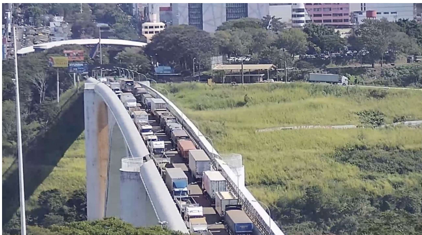
Figure 2. Heavy truck traffic on Amizade Bridge. Screenshot, Portal da Cidade broadcast, July 24, 2020. https://foz.portaldacidade.com/cameras-ao-vivo/ponte-da-amizade-sentido-paraguai

are Sleeping Rough on the Border” a newspaper piece described a “legion of workers” with their families, who left São Paulo, Brazil, for Foz do Iguacu, where they would cross the border on foot. After registering their departure from Brazil, they faced bars preventing them from entering their own country. Those who were unable to find shelter waited for days, crammed on the 550-metre-long Amizade Bridge, sleeping rough, without food or healthcare (Figure 3). They received “voluntary help from Paraguayan Navy officers responsible for local surveillance, and from groups of Brazilian volunteers” (Paro 2020). The blockade created the figure of “sanitary refugees” (Junqueira 2020), a concept used by Brazilian diplomats to describe this distressing situation of Argentines and Paraguayans temporarily trapped in between borders.