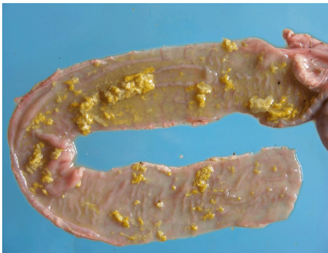
Figure 1 - Wild boar, Ileum. Wall thickening with white-yellowish fluids and flakes scattered over the mucosal surface.

(LAWSON & GEBHART, 2000) due to L. intracellularis infection. Additionally, some lesions were similar to that reported in an outbreak of PCV2 infection in wild boars (CORRÊA et al., 2006).