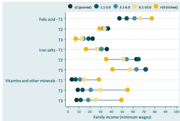
Fig. 2 Use of folic acid, iron salts and other vitamins and minerals among pregnant women in the Pelotas Birth Cohort according to the trimester of use and family income (N = 4270 women). Pelotas, RS, Brazil, 2015

prevalence rates of 55.4 and 81.9% for iron and folic acid use, respectively [26]. On the other hand, an Italian cohort study of 1000 women found a prevalence of iron salt use of 95.0% [28]. Lower prevalences of folic acid use, approximately 30.0%, were found by Mezzomo, et al. [29] and Barbosa et al. [14] in Brazil.