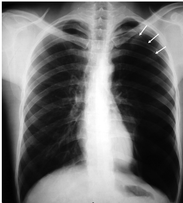
Figure 1 A thin line caused by the visceral pleura is seen separated from the lateral chest wall (arrows). Notice that no pulmonary vessels are seen beyond this line and that the line is curved.

In the supine patient, the highest part of the chest cavity lies anteriorly or anteromedially at the base near the