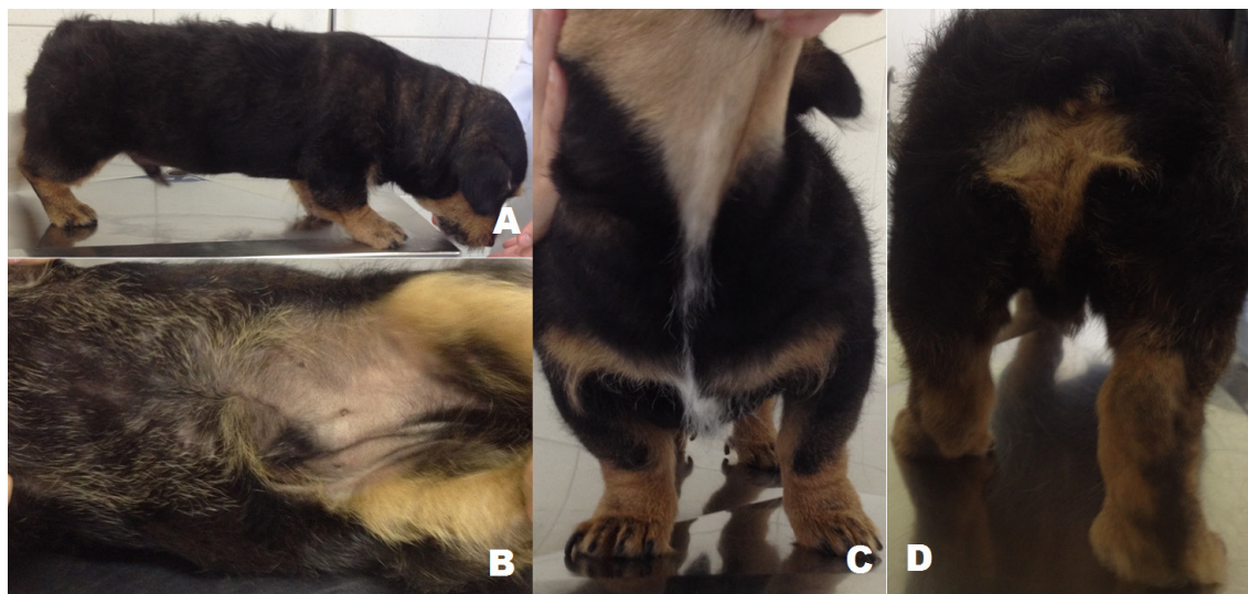
Figure 4. A- Excelent hair coat quality recovery, disproportionate dwarfism body conformation sustained; B- Complete hair coat coverage of ventral abdomen, remission of skin pigmentation and recovery from pyoderma lesions; C- Total hair coat coverage of cervical region; D- Total hair coat coverage of posterior surface of the pelvic limbs.

bodies growth plates closure (Figures 2B and 3B). Nevertheless, the spine X-ray demonstrated irregularities in terminal lamina surfaces of vertebral bodies, with ventral spondylosis formation, more prominent between L5-L6 (Figure 2B).