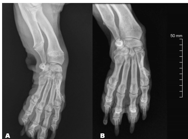
Figure 3. A- Radioulnar x-ray of the left forelimb after eight weeks of treatment with generic levothyroxine. Non-closure of epiphyseal plates is observed. B- Radioulnar x-ray after six months of treatment with brand-name levothyroxine approved for use in dogs. Complete epiphyseal closure.

The main laboratory findings were erythrogram within reference ranges with erythrocytes (Er) count of 6.09 millions/mm 3 (reference range – RR: 5.5-8.5 millions/mm 3 ), hematocrit (Ht) 43% (RR: 37-55%), hemoglobin (Hb) 14.5 g/dL (RR: 12-18 g/dL), total cholesterol 558 mg/dL (RR: 135-270 mg/dL), and fructosamine 459 µmol/L (RR: 170-338 µmol/L) with 92 mg/dL glycaemia (RR: 65-118 mg/dL). Thyroid function assessment showed tT4 5.1 ng/mL (RR: 15-30 ng/mL), fdT4 0.57 ng/dL (RR: 0.8-3.0 ng/dL) and cTSH 0.03 ng/mL (RR: 0.05-0.5 ng/mL), thus suggesting a secondary hypothyroidism diagnosis due to TSH deficiency.