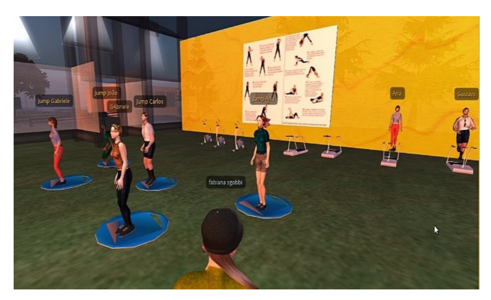
Fig. 3. - Aerobics class

When starting the participation, each person received a motion sensor which should be used 24 hours a day and should be synchronized at least once a day, through a mobile application. They also had their weights and abdominal circumference recorded. They also visited the virtual world, followed by the researcher who provided guidance concerning the navigation and the use of features available in the HIGIA System.