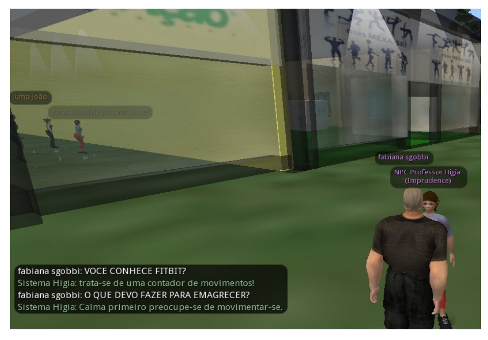
Fig. 5. Interaction of the practitioner with the HIGIA System

The conversation between the user's avatar and the agent involves answers emerged from the knowledge database built using the AIML language. The patterns of derived answers and questions were prepared in line with Ryan and Deci's [18] Theory of Self-Determination and with the support of physical education experts and a doctor. All manifestations of the conversational agent/NPC were designed in order to motivate the user to become physically active. Suggestions, tips, recommendations for health improvement in regard of obesity are presented in the dialogues established between the user and the agent (chatterbot). The table below shows a few examples of messages presented to the users.