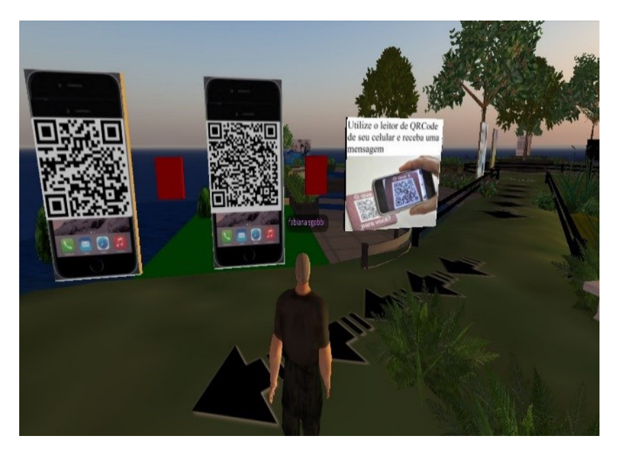
Fig. 4. – Season facts and photos

During the first stage of intervention (which lasted one month), the users could visit the virtual world as many times as they wanted. Thus, they could experience a fitness virtual environment. One of the participants mentioned that "it was the first time that he had ever stepped in a gym". They could also watch videos about methods and ways of losing weight, received tips from HIGIA's System conversational agent and, during the day, they also received SMS messages. Such messages were generated upon the analysis of the sensor's data, aiming at reinforcing behaviors or advising.