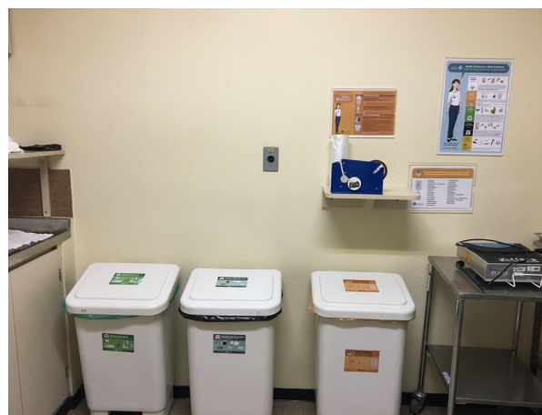
Figure 1: Arrangement recommended for waste disposal areas at the hospital wards.

Currently, Brazilian legislation determines that the waste producer is responsible for correct disposal 19 . Since 2013, the HCPA performs visual inspections of all waste containers every 2 months and discloses data on the rate of appropriate disposal