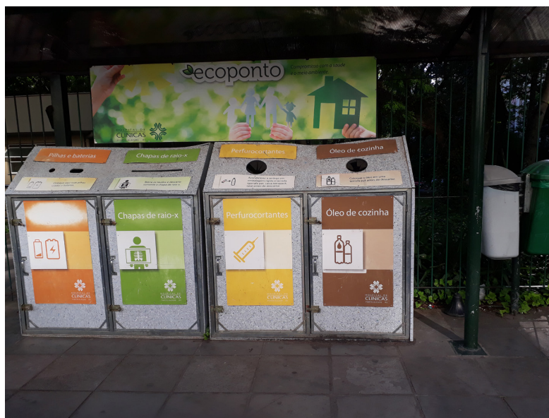
Figure 3: Recycling drop-off location in front of the hospital's Emergency Department.

services to be used in the Program of Organic Waste Reuse in Pig Breeding, which was created in 1992 and provides food to approximately 1,800 pigs 25 . Biological and sharps waste, in turn, is submitted to autoclaving, a process that uses steam and water at high temperatures to destroy potential pathogens from the contaminated material, reducing environmental risks. Diesel or lubricant oil is sent to treatment by external contractors.