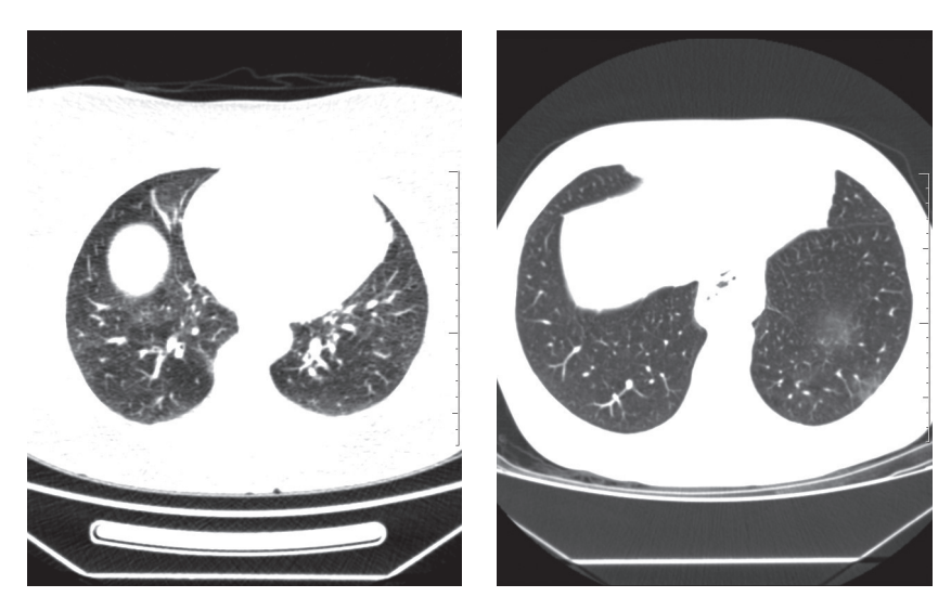
Figure 3. Axial chest CT scans showing areas of ground-glass attenuation in the left lower lobe.

as well as the varied sample characteristics. In this review, it was not possible to establish a consensus that could characterize a pattern of pulmonary aspiration in patients with dysphagia, and further studies on the subject are needed. Evidence suggests