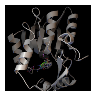
Figure 3: SABP2 and ligands at active site

<u>Conclusions:</u> The 31 structures with favorable score and positioned at active site, such as 2-(1H-Tetrazol-5-yl)phenol, are promising inhibitors for SABP2 and the ongoing molecular dynamics analysis can infer about the enzyme's conformational changes and the flexibility of residues located at active site. <u>Keywords:</u> Docking. Molecular dynamics. SABP2. Salicylic acid. <u>Supported by:</u> CAPES, CNPq, FAPERGS and UFRGS.