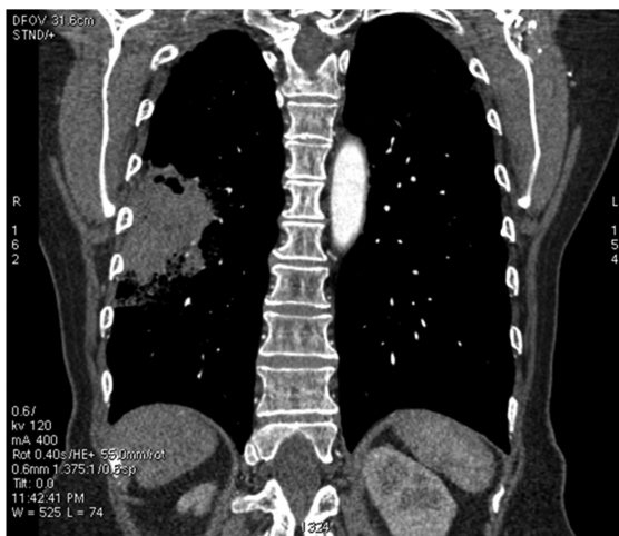
Figure 4: Reconstruction of a computed tomography (figure 3) in the coronal plane.

Furthermore, the antimicrobial susceptibility of Nocardia sp to meropenem, amikacin and ceftriaxone has also been reported to be high 4,5 .