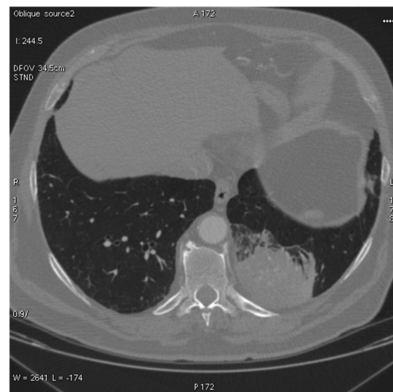
Figure 1: Computed tomography of the thorax showing a multilobulated lesion with soft tissue density and calcification in the left lower lobe.

A 43-year-old male, smoker, previously healthy, was admitted with symptoms of pneumonia (chest pain and weight loss of 12 kg). He had a history of pneumonia, treated with azithromycin, a year ago. Chest CT showed multilobulated lesion with soft tissue density and calcification in the left lower lobe (figures 1 and 2). Lung biopsy stained by hematoxyline and eosine (H&E) showed sulfur granules and Gram stain showed characteristic Gram-positive filamentous bacteria, and Actinomyces israelii grew in anaerobic culture. The treatment of choice would be penicillin