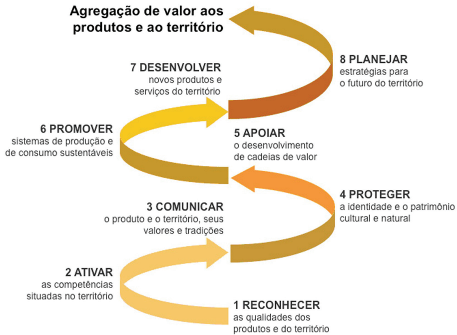
Figure 1. Examples of design actions can contribute to innovation applied to territory.