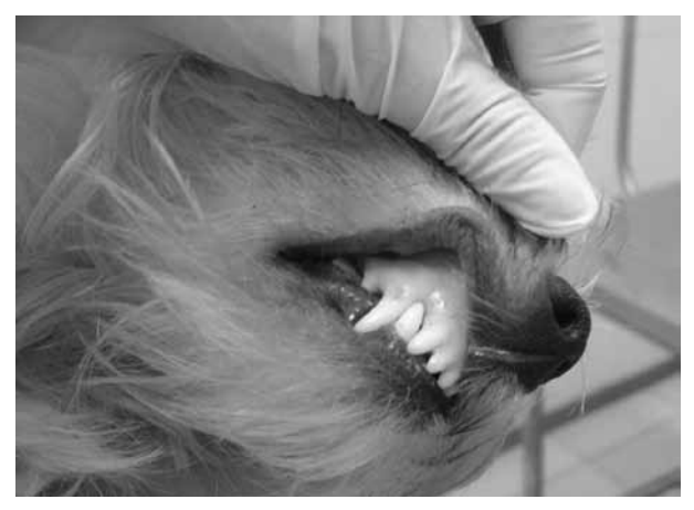
Figure 1. Pallor in 19-month-old WHWT puppy with erythrocytic PK deficiency.

At VTH – UFRGS, a macrocytic, hypochromic anemia was detected by a hematology analyzer (ABX micros, Horiba, São Paulo) and severe reticulocytosis was detected through manual reticulocyte count (table 1). The hyperchromic anemia observed in the first VTH – UFRGS exam may be due to in vitro lysis or technical artifact. On blood smear evaluation anisocytosis, marked polychromasia, and normoblastosis were present. However, no spherocytes,