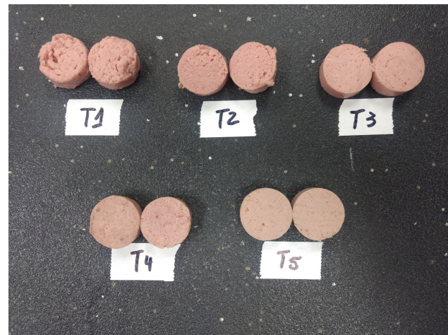
Figure 3. Prepared and cooked meat emulsions using residual sausage casing (RSC) as a partial or full replacement of a commercial binder ingredient. T1 = 100% RSC; T2 = 75% RSC; T3 = 50% RSC; T4 = 25% RSC; and T5 = 0% RSC.

According to Vasquez Mejía et al. (2019), hardness was generally greater when formulations included high levels of dietary fiber. This is because of the entrapment of water and fat within the fiber network, and these interrelations between fiber/hydrocolloid, water, and