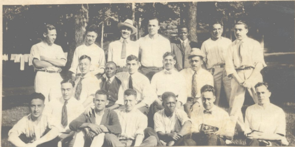
Representantes de 19 diferentes Nações.