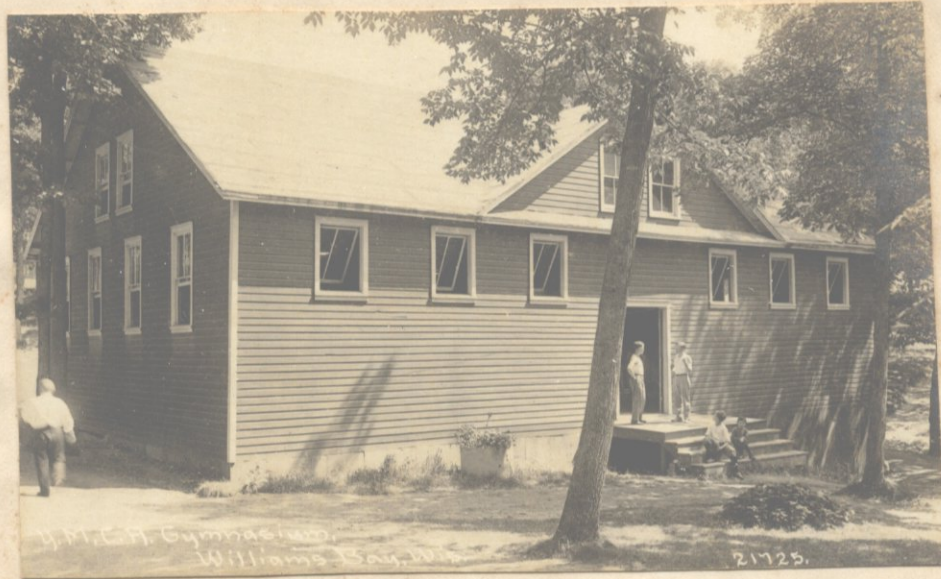
Edifício onde eram-nos administradas as aulas de Gymnastica Pratica.

Por ser necessaria muita economia, empreguei-me no Restaurante do Collegio como Garçon, desta forma recebia casa e comida mais $24 por mez. No Brazil seria isto impossivel, mas aqui não é reparado pois todos meus companheiros de serviço tambem o eram de aulas.