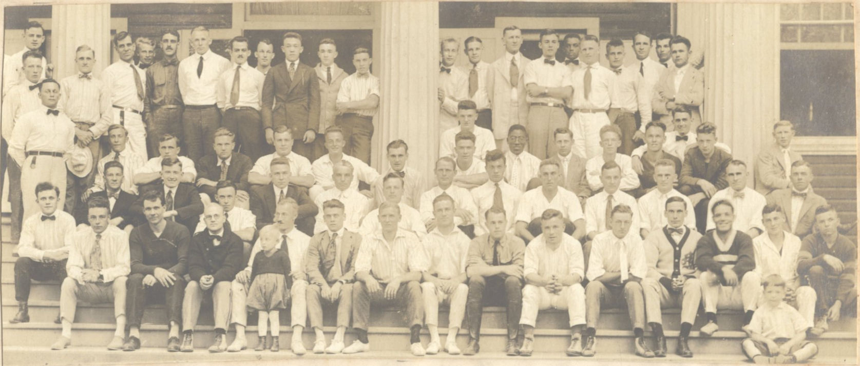
School of Physical Work College Camp 1918