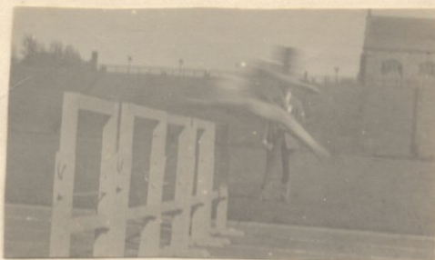
Fim dos obstaculos 22o.