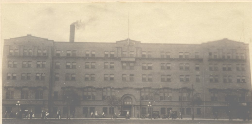
Edificio da A.C.M. Sears Roebuck Depart. Pelo tamanho do exterior bem podeis imaginar a quantidade de privilegios aos socios,offerecidos por ella.