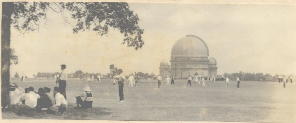
Campo para os trainings athleticos, é situado nos fundos do "College Camp". Aos fundos ve-se o "Yerkes Observatory" de Williams Bay.