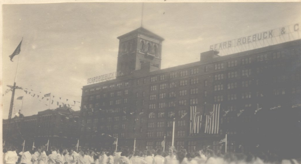
Parte Norte do edificio da fabrica,vendo-se na frente o campo athletico com as meninas promptas para o "Wand-Drill".

A assintencia ao meeting sportivo era cerca de 40,000 pessoas e como podeis ver pelas photogra- phias era um aspecto colossal.