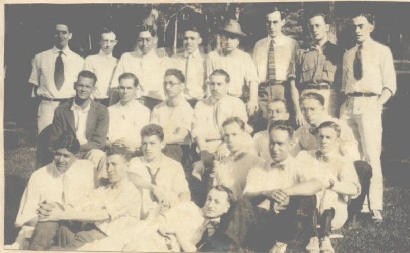
Representantes das Republicas Sul Americanas.

E enquanto o mundo está em guerra, estes estão em paz, unidos e com o mesmo Ideal debaixo da bandeira da Associação Christã de Moços.