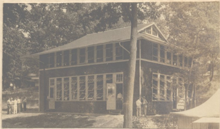
Edificio no qual eram dadas as aulas theoricas. "Brawn Hall" como chamavam.