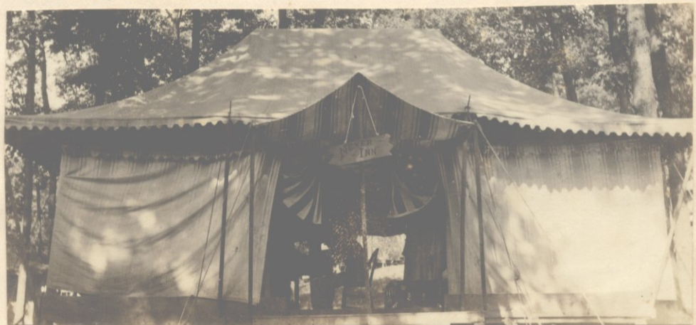
Barraca em que passei os meus dias no College Camp.