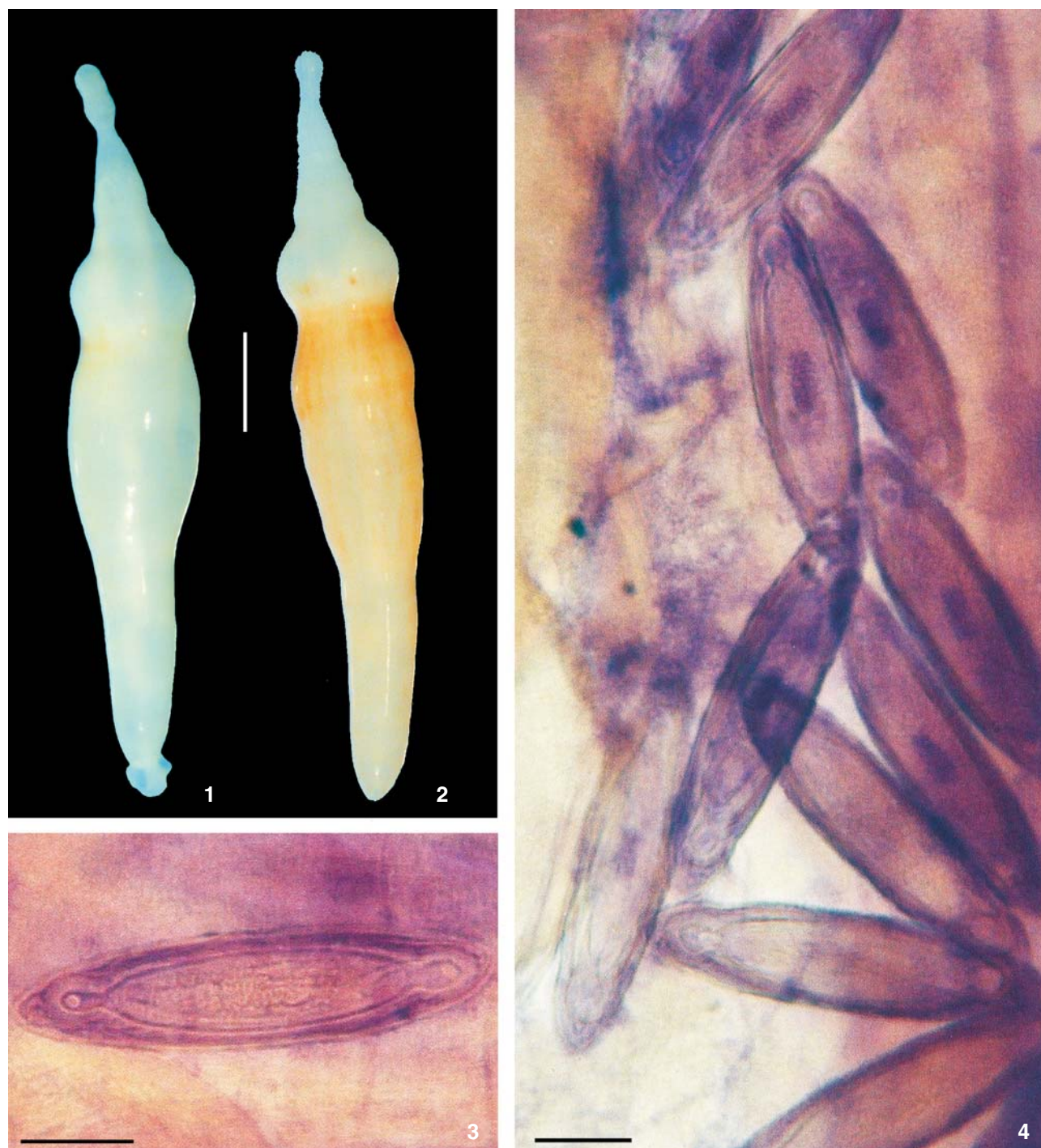
Figures 1-4. Andracantha tandemtesticulata sp. nov., parasite of Neotropical cormorants, Phalacrocorax brasilianus : (1-2) body pigment, specimens without compression (1) male, paratype without compression; (2) female, paratype without compression, bar = 1 mm; (3) egg showing polar inflations, bar = 25 \mu m; (4) eggs showing polar inflations and stained embryos, photographed through the body wall, bar = 25 \mu m.