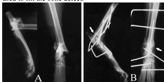
Figure 2. Radiographic images of traumatic luxation of the tarsocrural joint in a cat. (A) Forty-five days after tarsocrural arthrodesis. (B) Stable union of the arthrodesis (arrows).