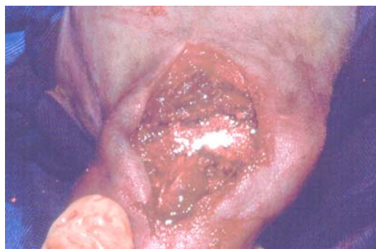
Figure 1. Photographic image of the surgical procedure of elbow arthrodesis. Hydroxyapatite was used to fill the bone defect.

No formation of fistulas or a purulent exudate that could be associated with the presence of hydroxyapatite was observed. Radiographic analysis revealed migration or excess of the biomaterial applied during the surgical procedure in soft tissues.