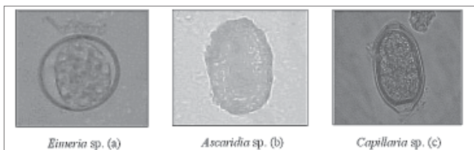
Figure 3. Eimeria oocyst (a), Ascaridia egg (b) and Capillaria sp. (c). (40 X).

however, with a smaller rate than was observed in Minas Gerais (100% for H. columbae ). The investigation into the prevalence of blood parasites in pigeons and other birds in Costa Rica 4 , Alaska, 8 and Japan 9 revealed rates lower than 10%; in the United States 13 , Colombia 10 , Bulgaria 7 and in Queensland 5 , Australia, the prevalence rates ranged from 20 to 32% for Haemoproteus sp. Similar or higher prevalence rates for Haemoproteus sp than those observed in this study were found in Uganda 11 (76.5%), in South Africa 12 (80%), on the Canary Islands 3 (82%), and on the Galapagos archipelago 6 (89%). The prevalence of gastrointestinal nematodes in Columba livia pigeons was higher than that obtained for Minas Gerais, in southeastern Brazil 14 ; another study showed coccidial oocysts, but no prevalence data, unlike another study with pigeons from the public squares of Lages, where 100% of fecal samples revealed the presence of oocysts, in addition to a prevalence rate higher than 30% for nematode eggs, besides the predominance of Ascaridia sp 3,14,18 . Neither of the referenced studies revealed the presence