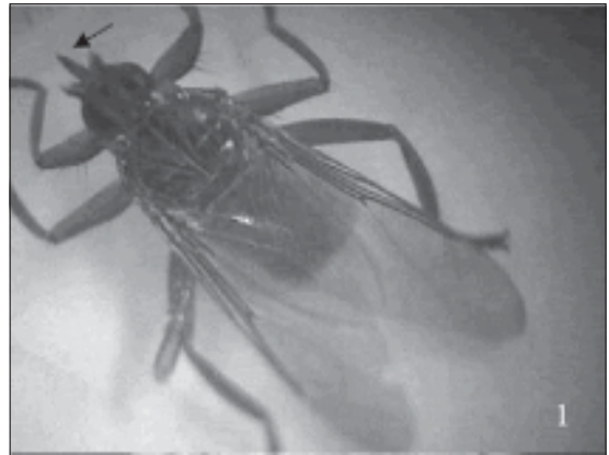
Figure 1. Hippoboscidae fly detected in Columba livia pigeons in Lages, state of Santa Catarina, Brazil.

The results of the present study demonstrated higher rates of blood parasites than the other few studies carried out in Brazil in two regions of the state of São Paulo for H. columbae ,