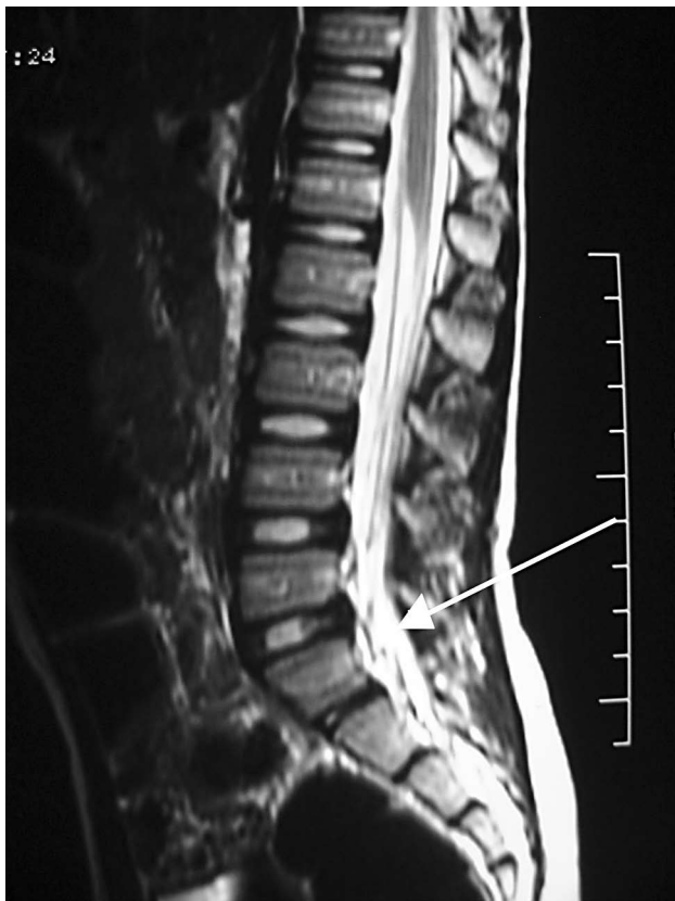
Figure 2 - Spinal MRI showing slight enhancement of the lower sacral nerve roots

By the 25th day of treatment, the patient had improved markedly, and he was discharged from hospital approximately one month after admission, with mild gait impairment still present. Five additional weeks of thiabendazole treatment were prescribed, along with a functional rehabilitation plan. Two months after discharge, the patient's neurological examination was completely normal.