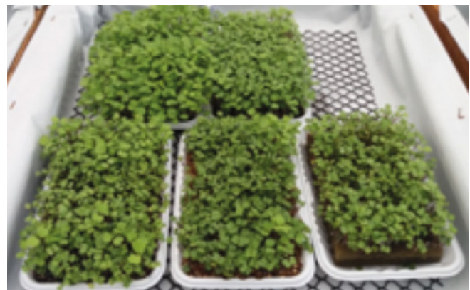
FIGURE 1. Microgreens in white polystyrene trays distributed in rectangular pools.

Sowing was performed manually on February 22, 2018, using arugula Folha Larga seeds (Sakata®) with lightly cut leaves and bright green coloring, at a density of 0.10 kg m 2 in a previously wetted substrate. The substrates were placed in white polystyrene trays of 0.14 m x 0.21 m and 0.015 m deep, without compartmentation and perforated at the base (Fig. 1). Each tray received a layer of approximately 0.01 m of the substrate, on which the seeds were deposited.