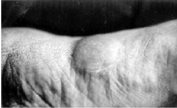
Fig. 1.- Tumefaction in the cavum of the right foot. Note the inexistence of draining sinuses.

On Mar/94, the patient was admitted to our hospital complaining of the tumefaction on his right foot and pain on walking. Physical examination revealed a tumefaction (3.0 x 3.5 cm) on the plantar arch of his right foot. The skin over the lesion was slightly erythematous, but no crusts were seen neither nodules were palpated ( Fig. 1 ).