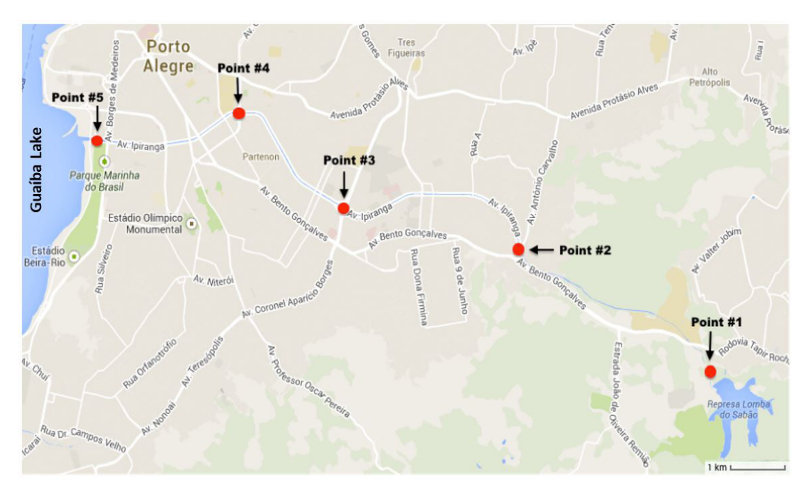
Figure 1. Satellite view of Porto Alegre, showing the collection points along the Arroio Dilúvio from the source (Point 1, East) to the end (Point 5, West) (shown as dots and pointed by black arrows). Figure made with the aid of Google Earth Protm.

by Katayama et al. (2002) with minor modifications (Vecchia et al., 2015). Briefly, 500 mL of each water sample were mixed with 0.3 g MgCl<sub>2</sub>, and the pH was adjusted to 5.0 with 10% HCl. Subsequently, the resulting mixture was filtered through a type HA negatively charged sterile membrane (0.45 \mu m pore size; 47 mm diameter). The membrane was rinsed with 87.5 mL of 0.5 mm H<sub>2</sub>SO<sub>4</sub> (pH 3.0), followed by elution of viral particles adsorbed to the membrane with 2.5 mL of 1 mM NaOH (pH 10.5). The filtrate was then neutralized with 12.5 \mu L of 50 mM H<sub>2</sub>SO<sub>4</sub> and 12.5 \mu L of 100 × Tris-EDTA (TE) buffer. The resulting mixture was stored at -80 °C until further processing.