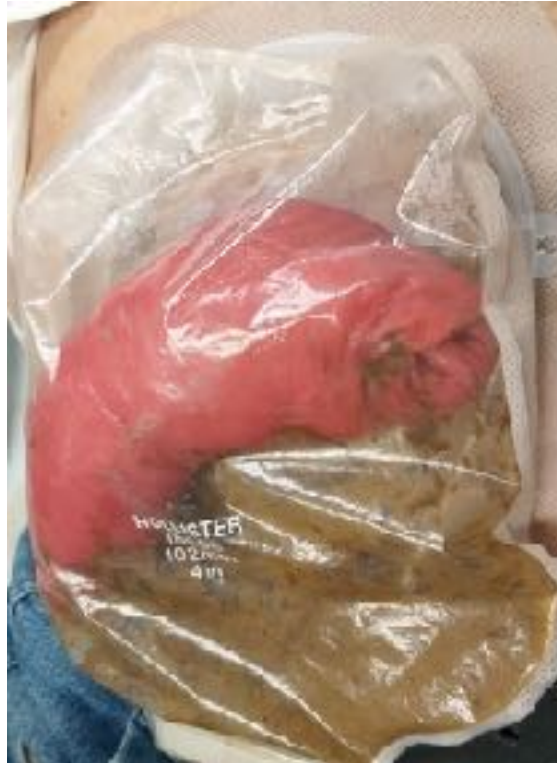
Figure 1. Stoma with prolapse. Porto Alegre (RS), Brazil, 2020.

working and the volume of the prolapse caused him discomfort. In two consultations, the edema in the prolapsed mucosa was presented, making reduction difficult. In subsequent consultations, the persistence of the prolapse, which was still reduced manually, was detected. On one occasion, episodes of diarrhea were reported, causing irritative dermatitis in the peri-estomal skin and parastomal hernia. It was noticed that the patient was disgusted with his situation, saying he was upset because he couldn't work and that the prolapse bothered him a lot. The patient was instructed to contact the surgical team in a scheduled appointment in the service where he was doing the follow-up.