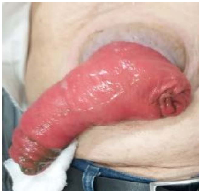
Figure 2: Stoma with prolapse. Porto Alegre (RS), Brazil, 2020.