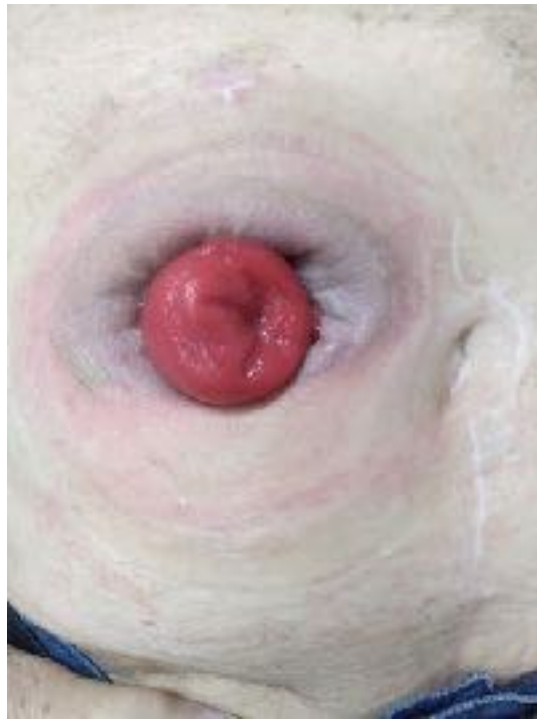
Figure 3. Stoma after manual 2020.

reduction. Porto Alegre (RS), Brazil, (2020).