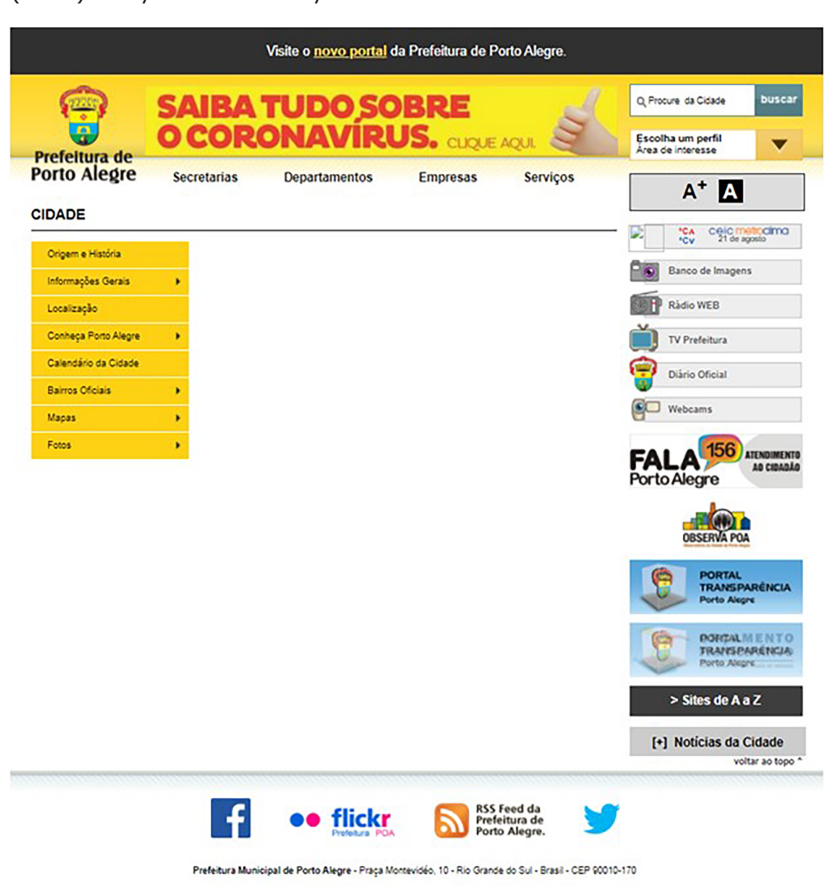
Fig. 1: Main page of the Porto Alegre City Government website [Prefeitura Municipal de Porto Alegre – PMPA], online version available until 2019.

In accordance with information provided by PROCEMPA, the PMPA website was launched in 1999 and modernized between 2003 and 2004. This version remained available online until 2019 (Figure 1). This was the version Silva (2005) analyzed in his study mentioned earlier.