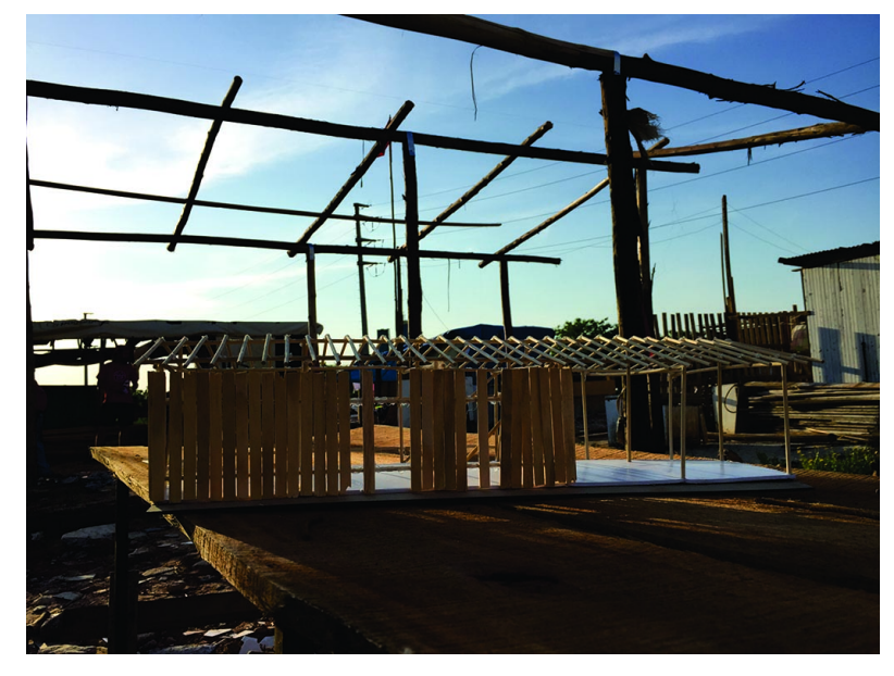
Fig. 3:In the foreground, the community shed model. Right behind, the structure of the building under construction.