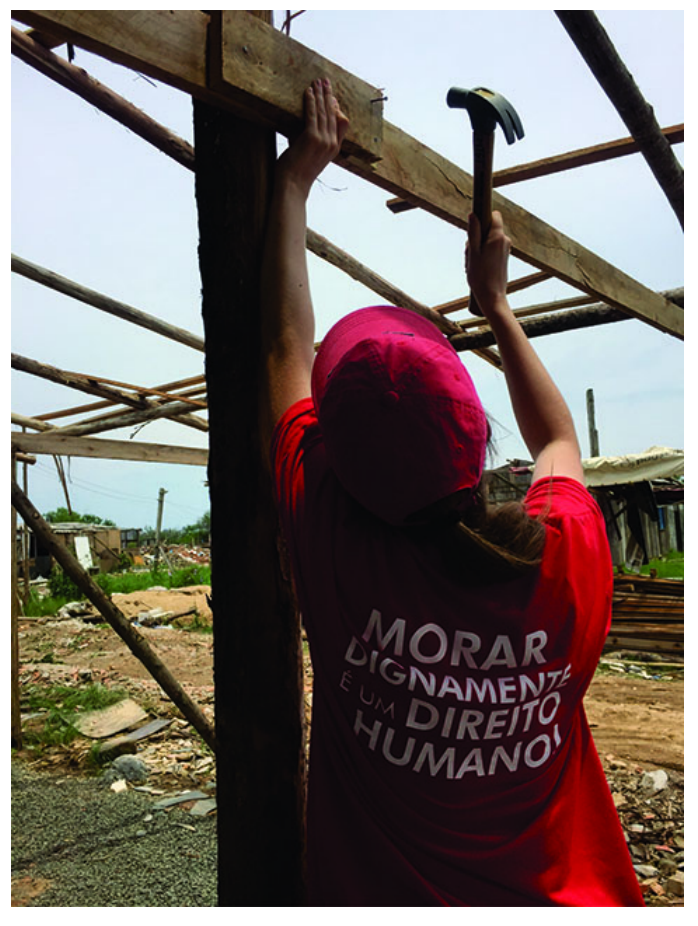
Fig. 4:FA/UFRGS academic community and PSM/POA residents building together with the community shed.