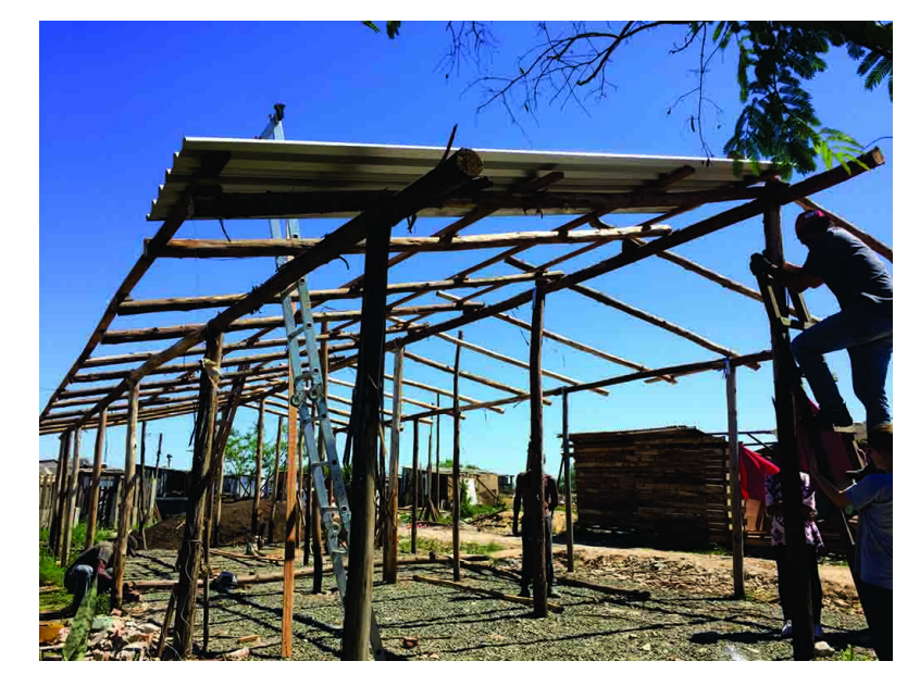
Fig. 5:FA/UFRGS academic community and PSM/POA residents building together with the community shed.

Two important assumptions of the extension activity were: the constructed building would not be a commodity (what mattered was its use value, not its exchange value), and its production renounced the salepurchase of the workforce (as it assumed collaboration). These aspects, per se , interfered in the process and challenged the logic of capitalist production. Another important aspect was the elimination of hierarchy at the construction site. The design was always present but as an invitation to dialogue, rather than an order. That is why it was never up to a conclusion; it has always been ready to incorporate or revoke suggestions. As a result of teamwork, the authorship of the architectural design was diluted among all those who discussed its solutions. It was also a means of questioning the conventional professional practice, which is hierarchical and attributes value to the authorial work of star architects.