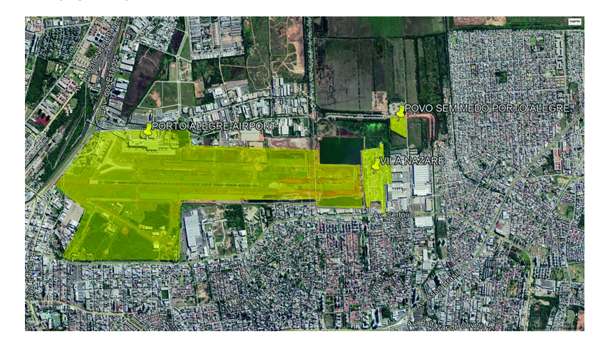
Fig. 1: Porto Alegre's northern area and the indication of Salgado Filho international airport, Vila Nazaré and Ocupação Povo Sem Medo.

The area where PSM/POA and Vila Nazaré settlements are located became highly valued due to the prospect of the airport's expansion. There have been several significant works in the area: the extension and duplication of avenues, implementation of urban infrastructure, the construction of business condominiums, etc. Therefore, in the coming years, it will become an important vector for urban expansion in one of the last available land stocks (Figure 1).