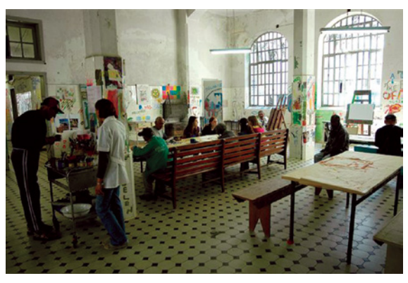
Figure 3 . Creativity Workshop of São Pedro Psychiatric Hospital.

Then, the second scene: the glance that comes back is your outside , a small space which composes itself, constantly fades away and then started to be called Writing Workshop . The second scene then composes a new writing, for in the context of the experience it wants to enable us to see other possible widths for the meeting between art and madness, such as the unexpectedness of a word that has not been written, a future book that insists on the violence of the language that interrupts the stare by diluting all types of matter between our fingers, whether material or immaterial.