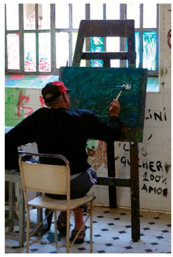
Figure 4. Art and madness in the Creativity Workshop.

In the history of the world, madness was disheveled. Enclosed within the gates of the asylum, the excesses did not allow the impossibility of death to drain out, neither the strong absence which made it experience its own threshold by inventing another place and a smaller language. In the Workshop , writing worked as the brush that aims to question the dominant narrative of the experts, in order to – based on this emerging language – provide another texture to the thread, opening up to the production of a new history