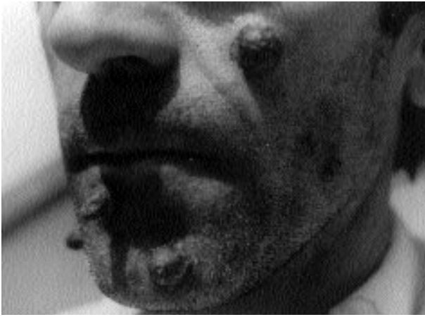
Figure 1. Cutaneous lesions on the face due to C. neoformans var. gattii .