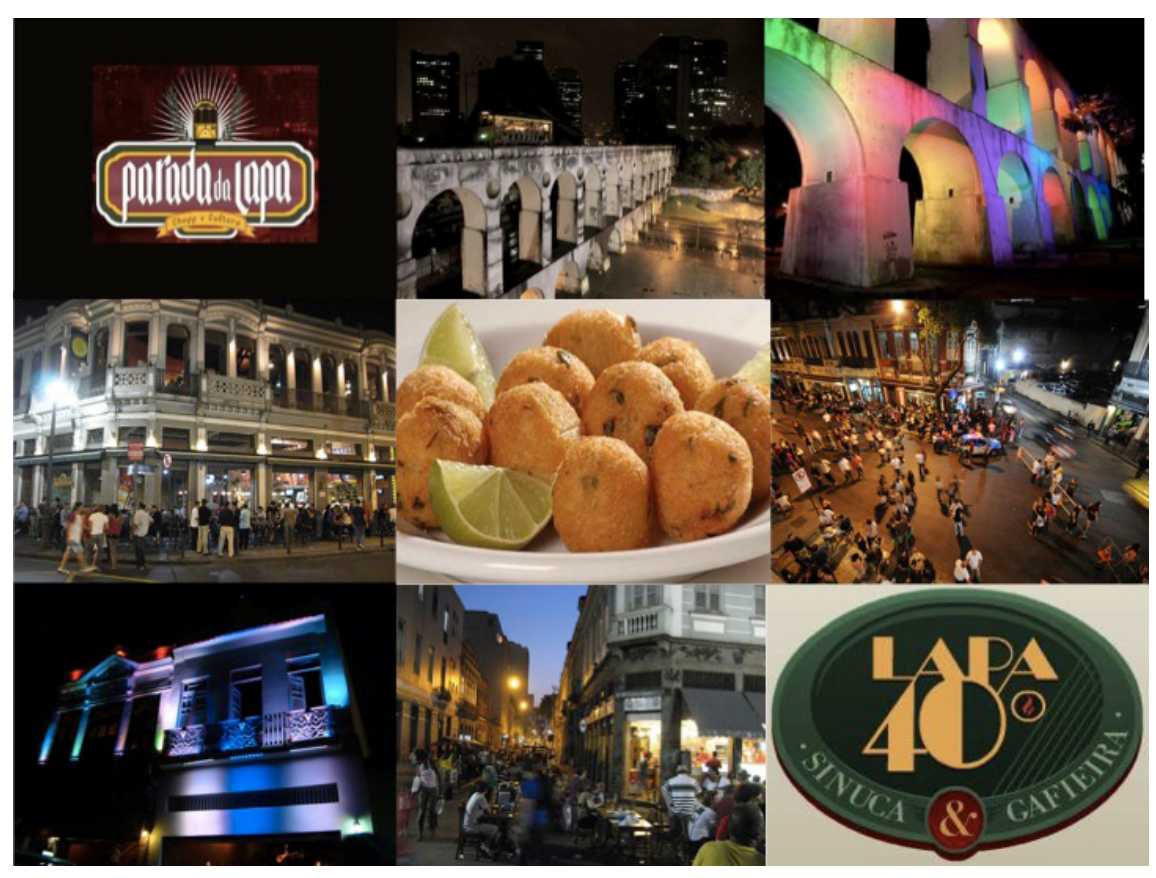
Figure 4. Lapa 25 Degrees scenario.