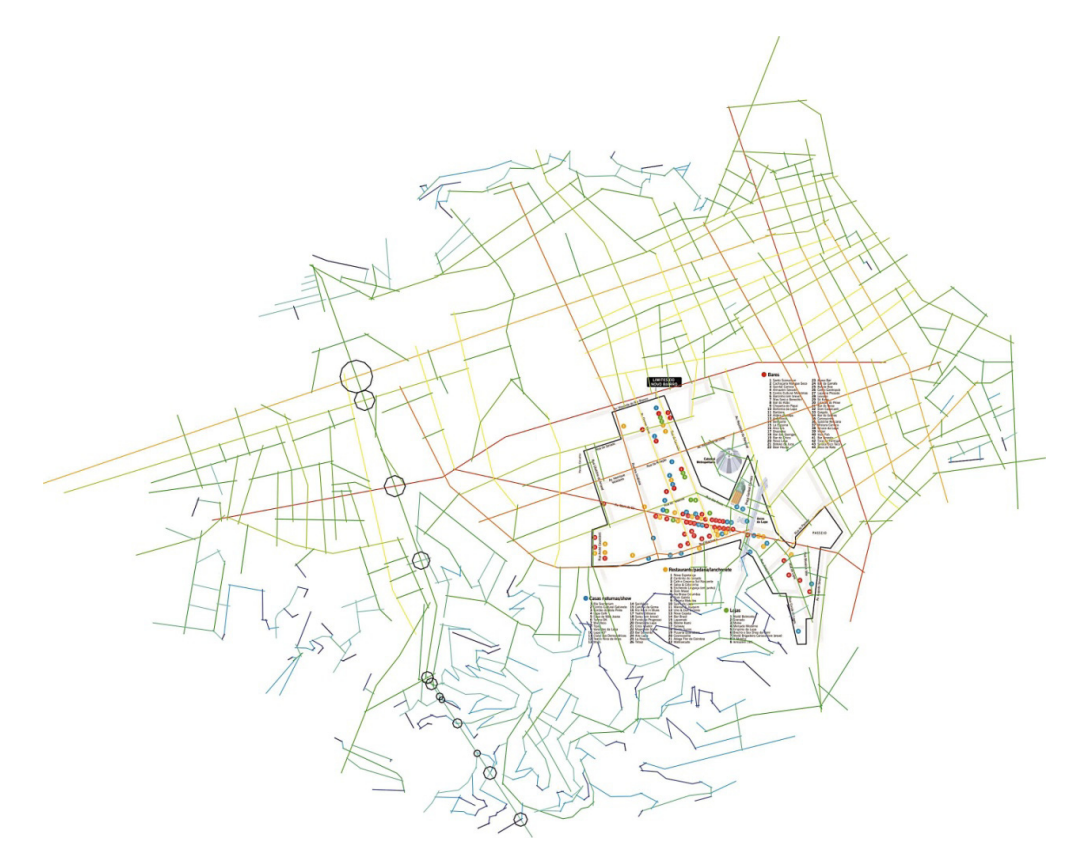
Figure 8. Map of local integration.

tivities, although the estate market focus was on housing for middle and high-income population, which already was a plausible reality linked to the morphological conditions of the place. This case seems to point to the New Lapa scenario (intensification of nightclubs):