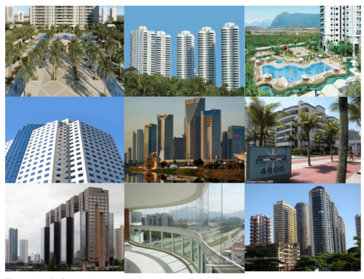
Figure 5. Lapa Garden scenario.