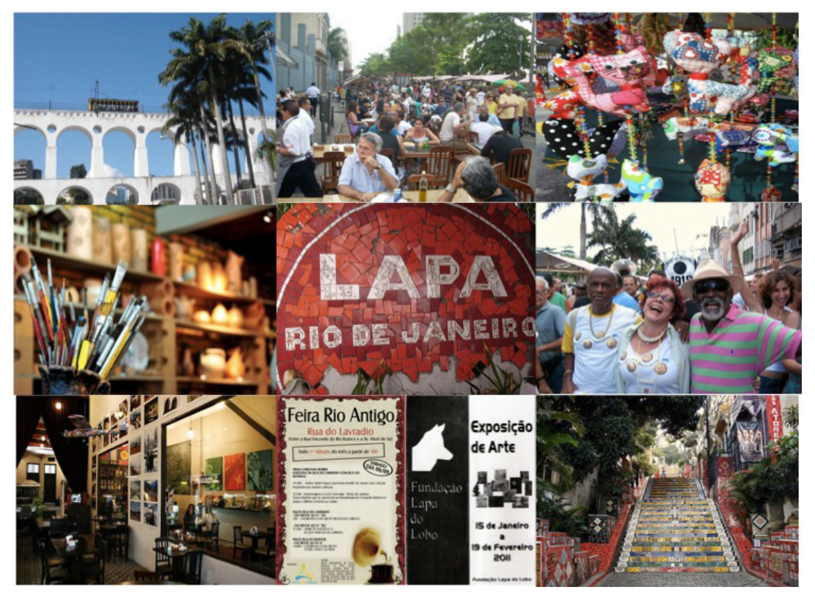
Figure 6. Lapa Art scenario. Source: Made by Paulo Reyes (2013).

showing signs from planning laws that changed the density of the area, focusing on economic value over the cultural one.