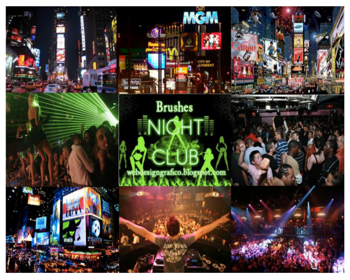
Figure 3. New Lapa scenario.

As seen before, the architect's mental model structures the process of project oriented towards a unique solution of its own genius loci . On the other hand, Scenarios proposals work as a disruption of this prime mental construction. In Lapa's case, the mental model points to "Lapa 25 Degrees" scenario, because this one most clearly expressed everyday life aspects of the area. Lapa Garden scenario is still less obvious and difficult to imagine. However, this scenario implies a strong pressure of real estate market in the area and is already