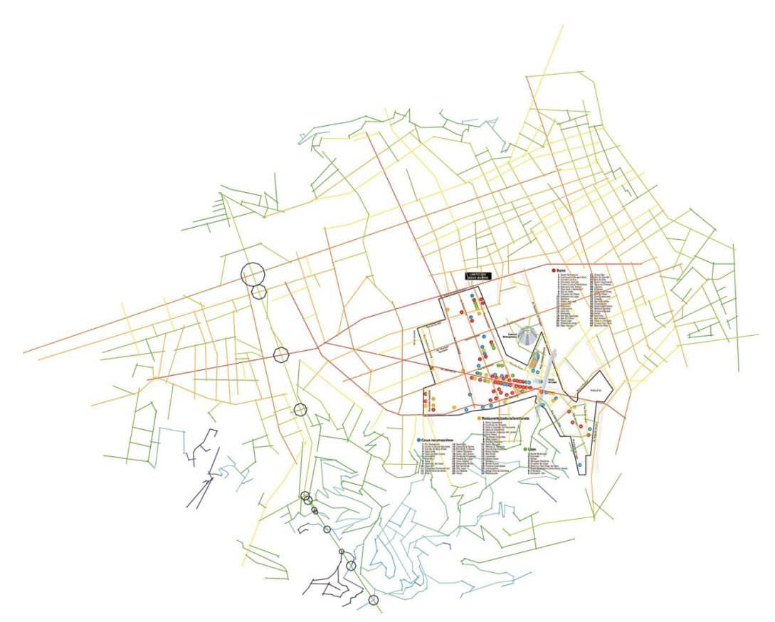
Figure 7. Map of global integration.

given to this place the central role that, in fact, actually occurs. The clipping of the new neighborhood of Lapa shows a part of a more regular morphology, formed by globally important axes, mainly by the presence of a diagonal axis – the Mem de Sá Ave., which unifies the axes in both directions of the grid. This condition reinforces the central role of this avenue and explains the diversity of uses and the concentration of non-residential activities, linked to the bohemian life - bars and nightclubs - but also marks a strong presence of activities related to everyday life, such as bakeries, restaurants, shops, etc. Moreover, this system of axis with high global integration penetrates directly into the city center of Rio de Janeiro, providing high accessibility between Lapa and the downtown area.