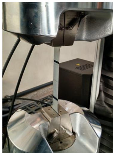
Figure 3. Test execution.

Tests were carried out using a universal tensile testing machine as illustrated in figure 3. Longitudinal strains were measured using a strain gauge extensometer while the strain in the width was measured with a digital caliper.